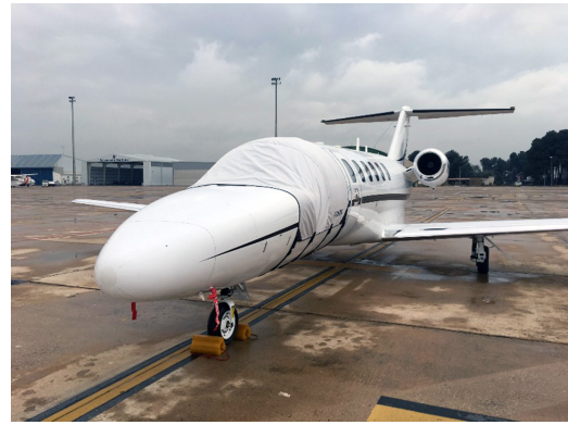
Cessna Citationjet 525A, CJ-2, & CJ2+ Cockpit Cover