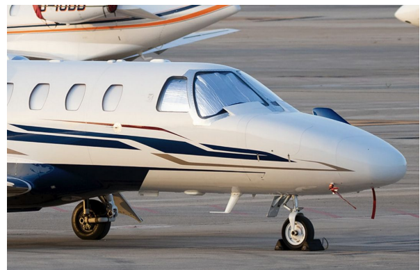
Cessna Citationjet 525, CJ-I, CJ1+, & M2 Cockpit Heatshields