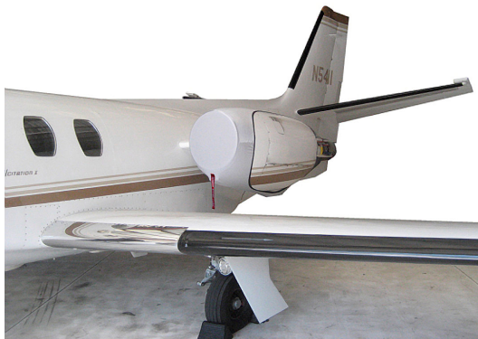
Cessna Citation "Bikini" Type Engine Covers: Extremely Light & Portable

The Cessna Citationjet 525A, CJ-2, & CJ2+ Intake/Exhaust Plugs are custom fit for the intake and exhaust openings, made with heavy-duty vinyl material, and stuffed with a single block of sculpted urethane foam. Each plug has a zipper that allows the foam to be removed and dried if necessary. Engine plugs have 'remove before flight' streamers sewn onto the face of the plugs. Most plugs are imprinted with the aircraft registration number in black. Engine plugs may be inserted after flight when the engine is still warm. Engine Inlet Plugs are commonly referred to as Cowl Plugs, Intake Plugs, Cowl Blocks, Engine Blocks, and Engine Bungs.