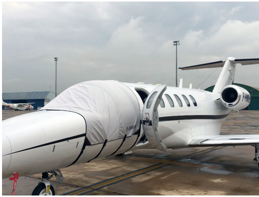
Cessna Citationjet 525A, CJ-2, & CJ2+ Cockpit Cover