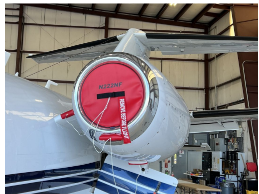
Cessna Citationjet 525A Intake Plugs Set