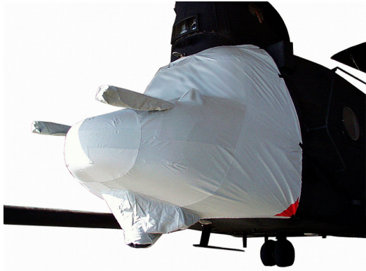
Spec. Op's CH-47: refuel boom, FLIR dome