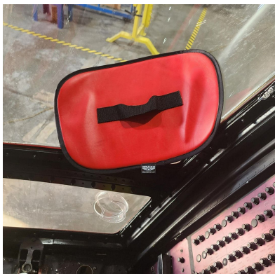
Boeing Vertol CH-47 Logger Window Plug