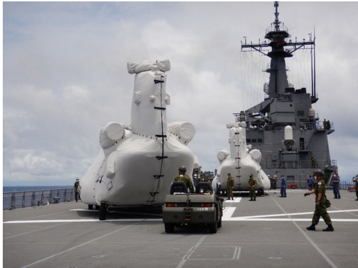
Boeing CH-47 Complete Body Cover

water resistance, UV resistance and anti-static buildup. The inner lining is a very soft and smooth microfiber to prevent scratching. The material is very reflective, and tests show that the cabin interior temperature can be reduced to near-ambient temperature on the hottest of days. It is water, ice and snow repellent, yet breathable to allow moisture to escape from between the cover and the aircraft surface.