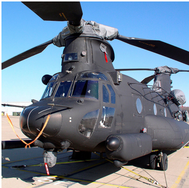
Boeing Vertol MH-47 Rotor Hubs, Engine & Other Covers