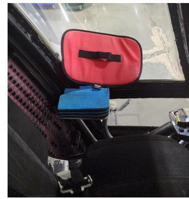
Boeing Vertol CH-47 Logger Window Plug