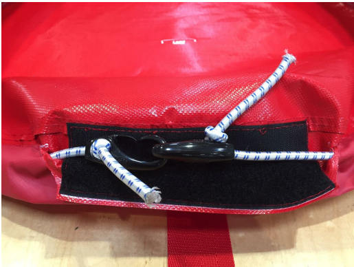
Boeing Vertol CH-47 Chinook Engine Exhaust Covers

shutdown. If you operate your aircraft in cold-weather, these covers will help prevent engine wear and tear.