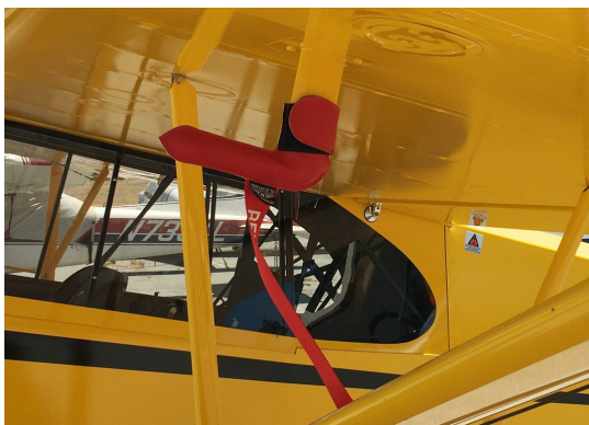
Cub Crafters CC-11 Carbon Cub Pitot Cover

Engine Inlet Plugs are custom fit for your CubCrafters CC-18, 19, 20, Top Cub, CCK-1865, CC-19 X-Cub, CCX-2000, EX-3, FX-3 intakes, made with heavy-duty vinyl material, and stuffed with a single block of sculpted urethane foam. Each plug has a zipper that allows the foam to be removed and dried if necessary. Engine plugs have warning flags that are visible from the cockpit or 'remove before flight' streamers sewn onto the face of the plugs. Most plugs are imprinted with the aircraft registration number in black for an extra charge. Storage bag NOT included. Engine plugs may be inserted after flight when the engine is still warm. Engine Inlet Plugs are commonly referred to as Cowl Plugs, Intake Plugs, Cowl Blocks, Engine Blocks, and Engine Bungs.