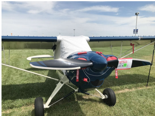
Cub Crafters EX2 Canopy Cover, Engine Plugs

This cover type is made from Silver Acrylic Sunbrella canvas and is 100% lined with a soft and smooth microfiber. Bruce's Custom Covers developed this material combination especially for aircraft protection. The outer material is medium weight and treated for water resistance, UV resistance and anti-static buildup. The inner lining is a very soft and smooth microfiber to prevent scratching. The material is very reflective, and tests show that the cabin interior temperature can be reduced to near-ambient temperature on the hottest of days. It is water, ice and snow repellent, yet breathable to allow moisture to escape from between the cover and the aircraft surface.