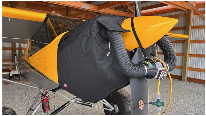
CubCrafters CCX-2000 Insulated Engine Cover