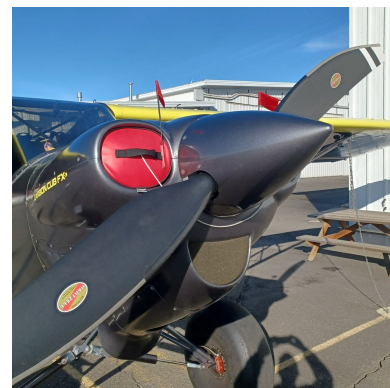
CubCrafters FX-3 Engine Inlet Plugs