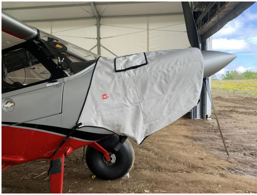
Cub Crafters CC-19 Engine Cover