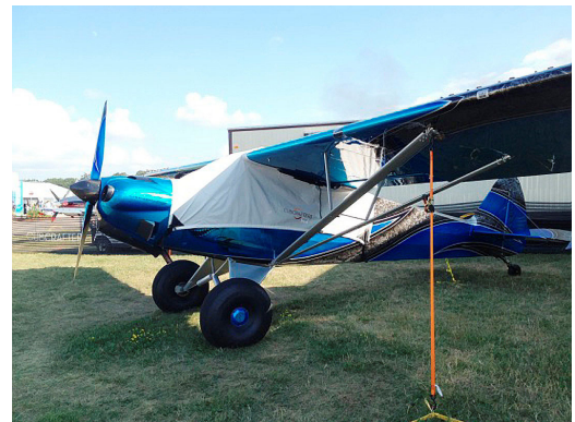
Cub Crafters Carbon Cub Canopy Cover