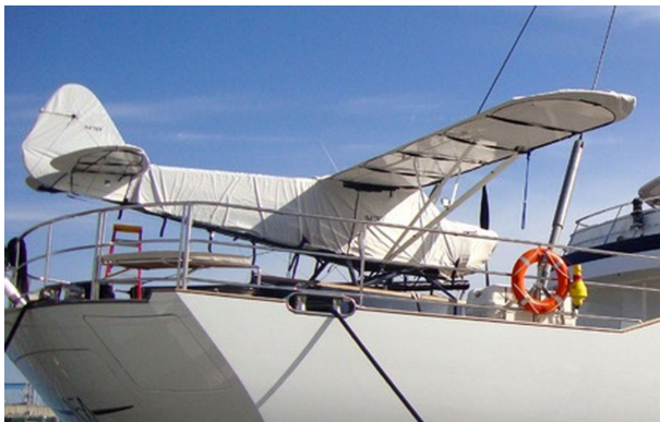
Cub Crafters CC-11 Complete Cover Set

This cover type is made from Silver Acrylic Sunbrella canvas and is 100% lined with a soft and smooth microfiber. Bruce's Custom Covers developed this material combination especially for aircraft protection. The outer material is medium weight and treated for water resistance, UV resistance and anti-static buildup. The inner lining is a very soft and smooth microfiber to prevent scratching. The material is very reflective, and tests show that the cabin interior temperature can be reduced to near-ambient temperature on the hottest of days. It is water, ice and snow repellent, yet breathable to allow moisture to escape from between the cover and the aircraft surface.