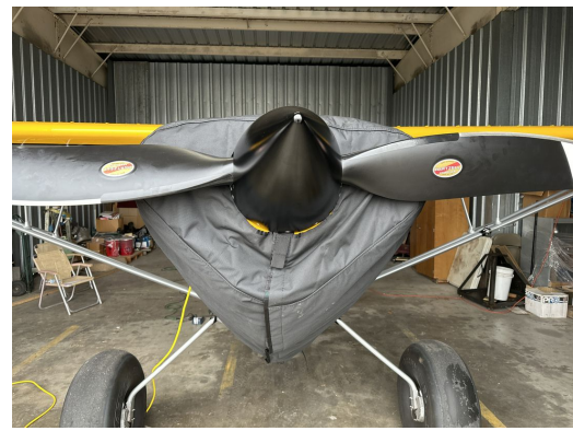
CubCrafters Insulated Engine Cove