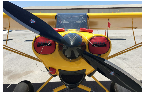
Cub Crafters CC-11 Carbon Cub Engine Plugs