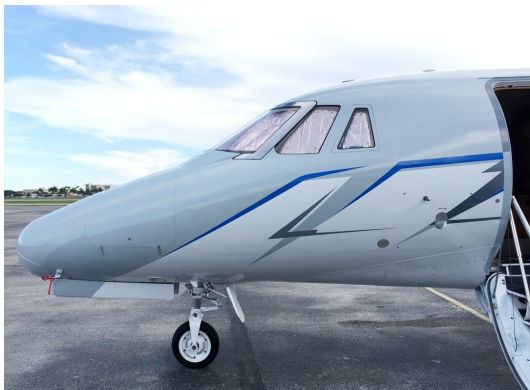
Cessna Citation 650 Cockpit HeataShields

Cockpit Heatshields are interior sunshades for the aircraft's cockpit. The product is a unique composite of closed-cell foam with a silver mylar finish. The semi-rigid design is stiff enough to stand inside the window framing. The set folds up flat and is easily stored in the included storage sleeve. Some designs may require velcro and suction cups. Our Heatshields for jets are offered white side out because some aircraft manufacturers have issued advisories against reflective window inserts due to potential heat damage. A Heatshield is an excellent short-term remedy for cockpit overheating, but an external fabric cover is more effective for long-term protection.