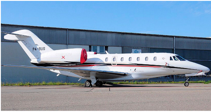
Citation X Intake & Pitot Tube Covers