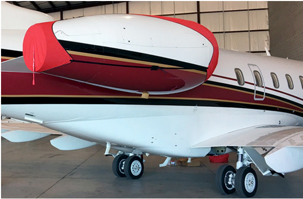
Intake/Exhaust Covers, 3-Strap Type. Successfully installed by two crew, one ladder.

which is stored in the included duffle bag, yet they unfold quickly for use. The Tri-Fold Ring cover is made of medium weight nylon which is available in a variety of colors to match the paint trim. Each cover set comes complete with installation and folding instructions. The aircraft's registration number can be silkscreened onto the cover for an extra charge.