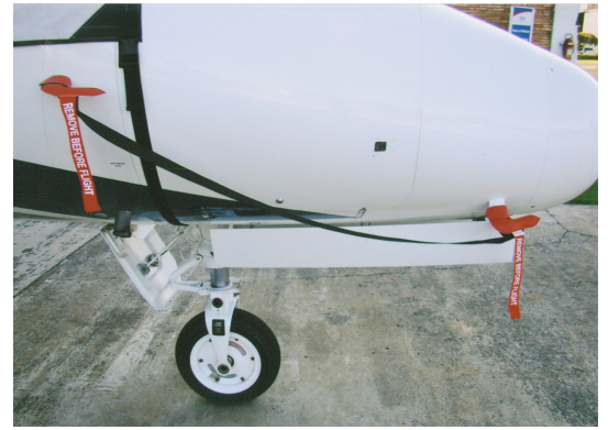
Citation XL Pitot Covers