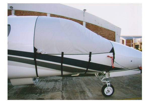
Citation Sovereign Cockpit/Nose Covers Selection