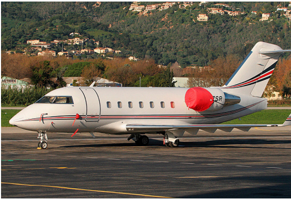
Challenger 601 Intake Covers, standard design