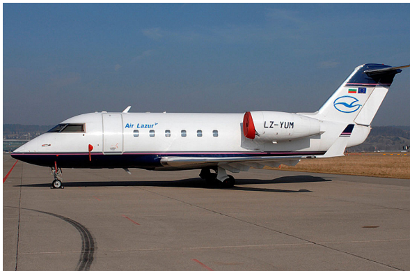
Challenger 600 Intake Covers

The Canadair Challenger 600 Intake Covers are designed to install easily yet be completely storable. A spring steel hoop is sewn into the hem of each cover, allowing them to be installed without climbing onto the wing or using a stepladder. To store the covers the spring steel hoop folds like a band-saw blade into three nesting rings. Each cover folds into a compact circular bundle which is stored in the included duffle bag, yet they unfold quickly for use. The Tri-Fold Ring cover is made of medium weight nylon which is available in a variety of colors to match the paint trim. Each cover set comes complete with installation and folding instructions. The aircraft's registration number can be silkscreened onto the cover for an extra charge.