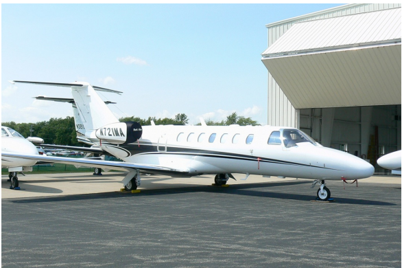
Cessna Citation CJ3 Bikini Style Engine Covers