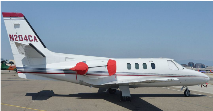
Cessna Citation Engine Covers and Heatshields