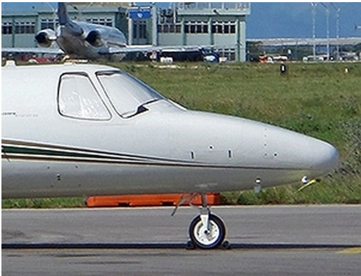
Cessna Citation S550 Cockpit HeatShields

Custom-made Heatshield Sunshades are available for almost any window in the jet. Side windows, Skylights, and Emergency Exits are all custom-made. The product is a unique composite of closed-cell foam with a silver mylar finish. The set is easily stored in the included storage sleeve. Some designs may require velcro and suction cups. Our Heatshields are offered white side out since aircraft manufacturers have issued advisories against reflective window inserts due to potential heat damage.