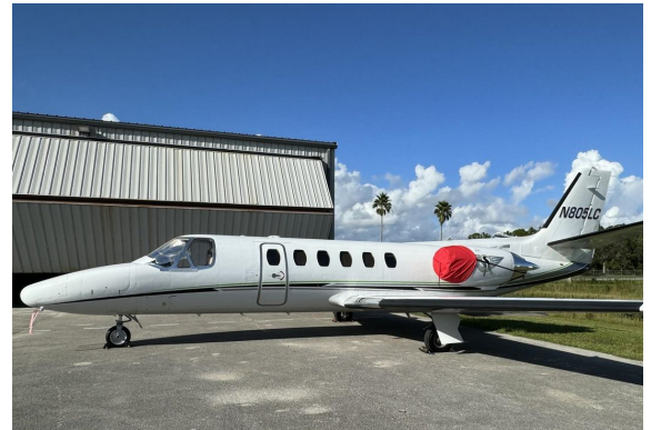
Cessna Citation 550 Intake Cover