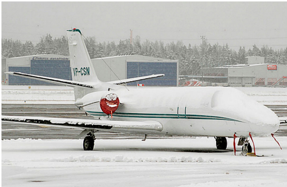
Cessna 560 Engine Inlet/Exhaust Covers, Pitot Cover Set

The Cessna Citation II (550, 551, UC-35A, with JT15D) Intake Covers are designed to install easily yet be completely storable. A spring steel hoop is sewn into the hem of each cover, allowing them to be installed without climbing onto the wing or using a stepladder. To store the covers the spring steel hoop folds like a band-saw blade into three nesting rings. Each cover folds into a compact circular bundle which is stored in the included duffle bag, yet they unfold quickly for use. The Tri-Fold Ring cover is made of medium weight nylon which is available in a variety of colors to match the paint trim. Each cover set comes complete with installation and folding instructions. The aircraft's registration number can be silkscreened onto the cover for an extra charge.