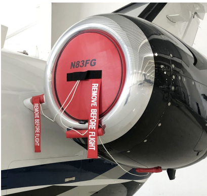
Cessna Mustang 510 Engine Inlet Plugs, Includes Intercooler Intake & Exhaust And Gen. Plugs