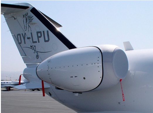
Citation Mustang Intake/Exhaust Cover, "Bikini" Type