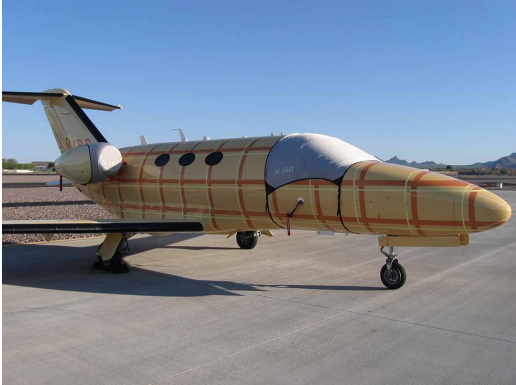
Citation Mustang Light Weight Windshield & Engine Covers