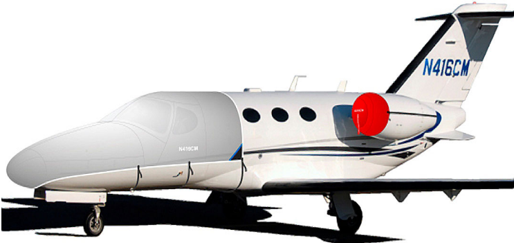
Citation Mustang Windshield Cover, Intake Cover/Exhaust Plug Set, Pitot Covers Citation Mustang Cockpit/Door/Nose Cover, Engine Inlet Cover