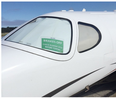
Cessna Mustang 510 Cockpit Heatshields