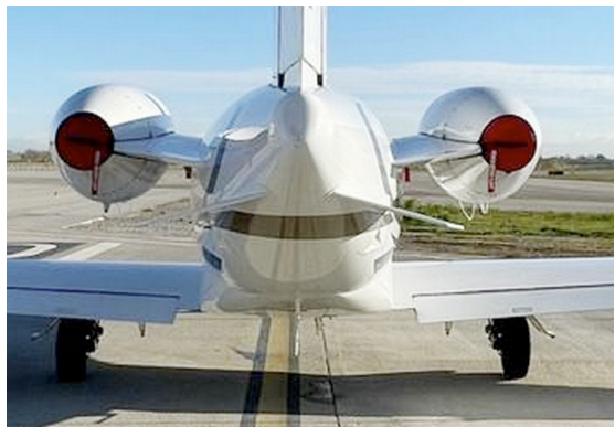
Cessna Mustang Exhaust Plugs

The Engine Inlet Plugs are custom fit for your Cessna Mustang 510 intakes, made with heavy-duty vinyl material, and stuffed with a single block of sculpted urethane foam. Each plug has a zipper that allows the foam to be removed and dried if necessary. Engine plugs have 'remove before flight' streamers sewn onto the face of the plugs. Most plugs are imprinted with the aircraft registration number in black for an extra charge. Storage bag NOT included. Engine plugs may be inserted after flight when the engine is still warm. Engine Inlet Plugs are commonly referred to as Cowl Plugs, Intake Plugs, Cowl Blocks, Engine Blocks, and Engine Bungs.