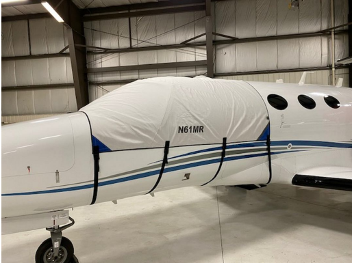
Cessna 510 Cockpit Cover extends to cover door

This cover type is made from Silver Acrylic Sunbrella canvas and is 100% lined with a soft and smooth microfiber. Bruce's Custom Covers developed this material combination especially for aircraft protection. The outer material is medium weight and treated for water resistance, UV resistance and anti-static buildup. The inner lining is a very soft and smooth microfiber to prevent scratching. The material is very reflective, and tests show that the cabin interior temperature can be reduced to near-ambient temperature on the hottest of days. It is water, ice and snow repellent, yet breathable to allow moisture to escape from between the cover and the aircraft surface.