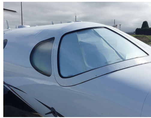
Cessna Mustang 510 Cockpit Heatshields