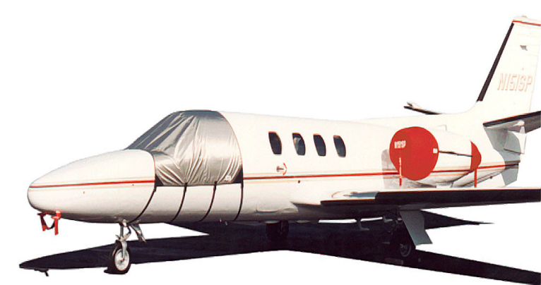
Cessna Citation Windshield, Pitot and Engine Covers

Travel Covers are made with Silver Solution-Dyed Polyester fabric and only lined over the windshield to save weight. The material is lightweight and more compact for easy stowage in the aircraft. The polyester material is water resistant, but only intended for occasional use outside. We also have an ultra lightweight material available for fitted hangar dust covers. For daily outdoor use, the non-travel Sunbrella Cover is the best choice.