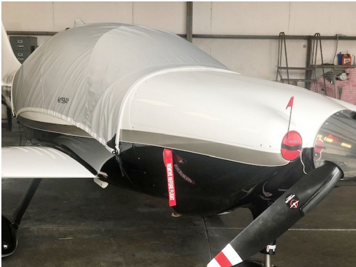
Columbia 350 Travel Cover, Engine Plugs