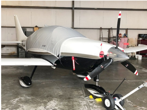
Columbia 350 Travel Cover, Engine Plugs

Travel Covers are made with Silver Solution-Dyed Polyester fabric and only lined over the windshield to save weight. The material is lightweight and more compact for easy stowage in the aircraft. The polyester material is water resistant, but only intended for occasional use outside. We also have an ultra lightweight material available for fitted hangar dust covers. For daily outdoor use, the non-travel Sunbrella Cover is the best choice.