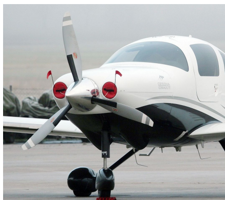
Cessna Corvalis, Corvalis TT, Models T240, 350 & 400 Engine Inlet Plugs, 400/Ttx Models