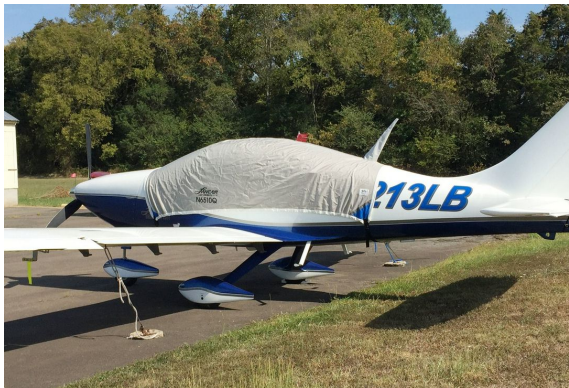
Lancair Columbia 350 Canopy Cover