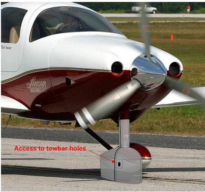
Nose Wheelpant/Strut Cover (illustration)