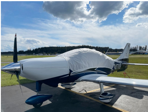
Textron T240 Canopy Cover

This cover type is made from Silver Acrylic Sunbrella canvas and is 100% lined with a soft and smooth microfiber. Bruce's Custom Covers developed this material combination especially for aircraft protection. The outer material is medium weight and treated for water resistance, UV resistance and anti-static buildup. The inner lining is a very soft and smooth microfiber to prevent scratching. The material is very reflective, and tests show that the cabin interior temperature can be reduced to near-ambient temperature on the hottest of days. It is water, ice and snow repellent, yet breathable to allow moisture to escape from between the cover and the aircraft surface.