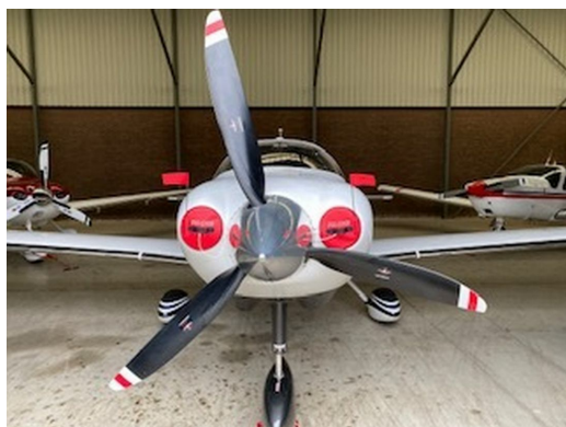
Cessna TTX T240 Engine Inlet Plugs

Engine Inlet Plugs are custom fit for your Cessna Corvalis, Corvalis TT, Models T240, 350 & 400 intakes, made with heavy-duty vinyl material, and stuffed with a single block of sculpted urethane foam. Each plug has a zipper that allows the foam to be removed and dried if necessary. Engine plugs have warning flags that are visible from the cockpit or 'remove before flight' streamers sewn onto the face of the plugs. Most plugs are imprinted with the aircraft registration number in black for an extra charge. Storage bag NOT included. Engine plugs may be inserted after flight when the engine is still warm. Engine Inlet Plugs are commonly referred to as Cowl Plugs, Intake Plugs, Cowl Blocks, Engine Blocks, and Engine Bungs . Designed to prevent damage to the aircraft extremities in crowded hangars, these products are made of bright red Naugahyde and thickly padded with a sandwich of closed cell foam.