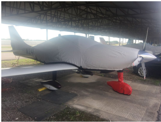
Lancair Columbia Extended Canopy/Engine Cover, Nose Wheelpant Cover

protection and cover longevity. This heavier more durable material is intended for all weather conditions, such as rain and snow or lots of sun.