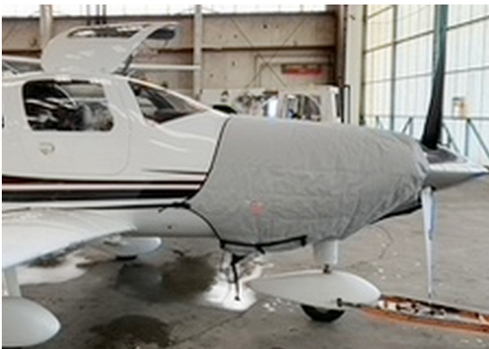
Cessna Corvallis Insulated Engine Cover

This cover type is made from Silver Acrylic Sunbrella canvas and is 100% lined with a soft and smooth microfiber. Bruce's Custom Covers developed this material combination especially for aircraft protection. The outer material is medium weight and treated for water resistance, UV resistance and anti-static buildup. The inner lining is a very soft and smooth microfiber to prevent scratching. The material is very reflective, and tests show that the cabin interior temperature can be reduced to near-ambient temperature on the hottest of days. It is water, ice and snow repellent, yet breathable to allow moisture to escape from between the cover and the aircraft surface.