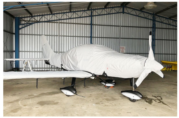
Columbia 350 Full Cover Set