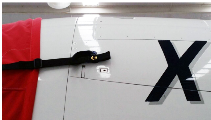
Cover Attachment Pin