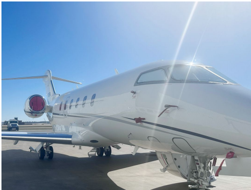
Canadair Challenger 300 Cockpit HeatShields, Intake Plugs