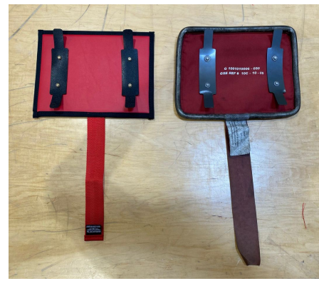
Canadair Challenger 300, 350 APU Intake Cover