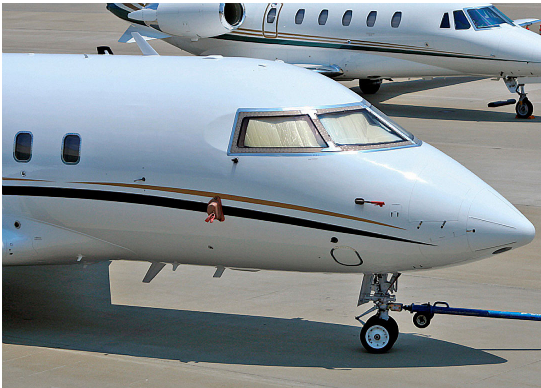
Challenger 604 Cockpit HeatShields