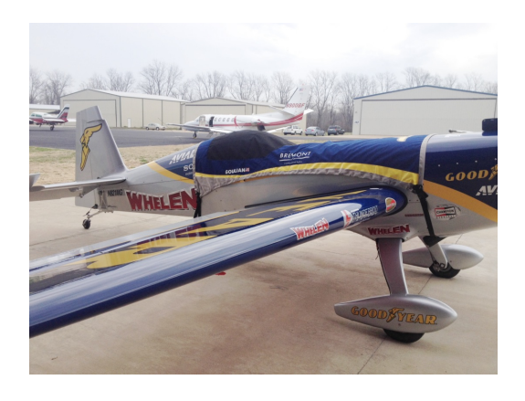
Extra 300SC with NASCAR style custom cover

The Mudry Cap 231 & 232 Canopy/Engine Cover is a one-piece cover (100% lined with microfiber) that is a combination of the Canopy Cover and Engine Cover. This cover will enclose the engine cowl and will extend aft to cover all of the windows. This cover type is made from Silver Acrylic Sunbrella canvas and is 100% lined with a soft and smooth microfiber. Bruce's Custom Covers developed this material combination especially for aircraft protection. The outer material is medium weight and treated for water resistance, UV resistance and anti-static buildup. The inner lining is a very soft and smooth microfiber to prevent scratching. The material is very reflective, and tests show that the cabin interior temperature can be reduced to near-ambient temperature on the hottest of days. It is water, ice and snow repellent, yet breathable to allow moisture to escape from between the cover and the aircraft surface.