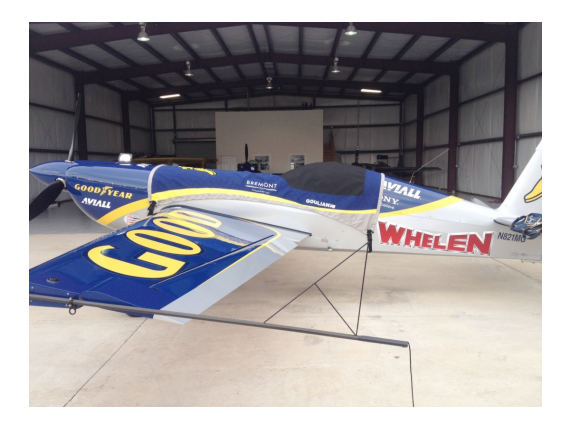
Extra 300SC with NASCAR style custom cover