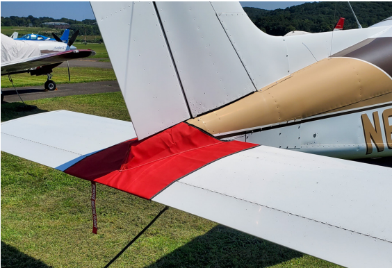
Beech Sundowner C23 Tailcone Cover, Fully Enclosed