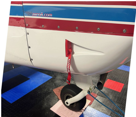
Beech Sundowner C23 Fresh Air Exhaust Plug (Pilot Side Of Fuselage)

plugs have warning flags that are visible from the cockpit or 'remove before flight' streamers sewn onto the face of the plugs. Most plugs are imprinted with the aircraft registration number in black for an extra charge. Storage bag NOT included. Engine plugs may be inserted after flight when the engine is still warm. Engine Inlet Plugs are commonly referred to as Cowl Plugs, Intake Plugs, Cowl Blocks, Engine Blocks, and Engine Bungs.