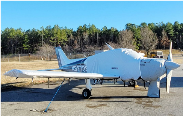
Beech Sundowner Winter Cover Set