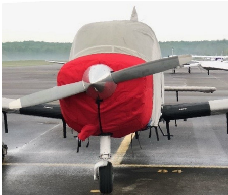
Beech Sierra Insulated Engine Cover

This cover type is made from Silver Acrylic Sunbrella canvas and is 100% lined with a soft and smooth microfiber. Bruce's Custom Covers developed this material combination especially for aircraft protection. The outer material is medium weight and treated for water resistance, UV resistance and anti-static buildup. The inner lining is a very soft and smooth microfiber to prevent scratching. The material is very reflective, and tests show that the cabin interior temperature can be reduced to near-ambient temperature on the hottest of days. It is water, ice and snow repellent, yet breathable to allow moisture to escape from between the cover and the aircraft surface.