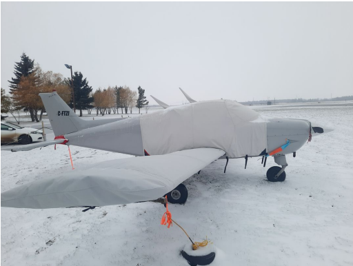
Beech C23 Sundowner Extended Canopy Cover, Wing Covers

WINTER USE MATERIAL - Made with Solution-Dyed Polyester fabric, this option is intended for seasonal use to aid in deicing, rain mitigation, or for occasional travel. The material is lighter and more compact, but more susceptible to UV damage and may have a shorter useful life if used continuously outside than the all-year use material.