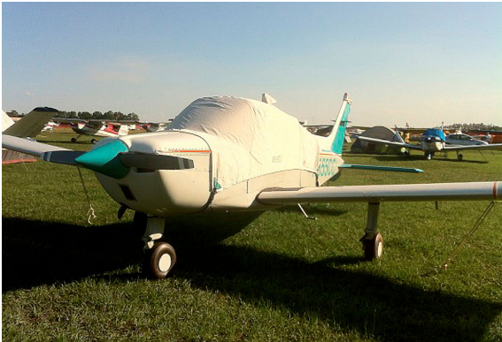
Beech C23 Sundowner Canopy Cover

Travel Covers are made with Silver Solution-Dyed Polyester fabric and only lined over the windshield to save weight. The material is lightweight and more compact for easy stowage in the aircraft. The polyester material is water resistant, but only intended for occasional use outside. We also have an ultra lightweight material available for fitted hangar dust covers. For daily outdoor use, the non-travel Sunbrella Cover is the best choice.