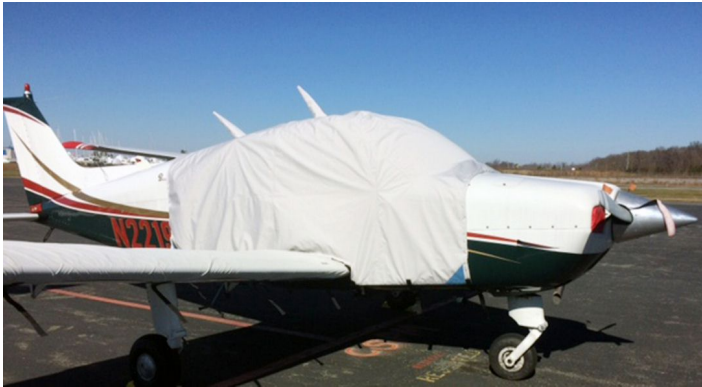
Beech Sundowner Extended Canopy Cover, Belly Strap Type

This cover type is made from Silver Acrylic Sunbrella canvas and is 100% lined with a soft and smooth microfiber. Bruce's Custom Covers developed this material combination especially for aircraft protection. The outer material is medium weight and treated for water resistance, UV resistance and anti-static buildup. The inner lining is a very soft and smooth microfiber to prevent scratching. The material is very reflective, and tests show that the cabin interior temperature can be reduced to near-ambient temperature on the hottest of days. It is water, ice and snow repellent, yet breathable to allow moisture to escape from between the cover and the aircraft surface.