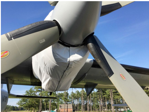
Casa 212 Engine Cover, test fit cover