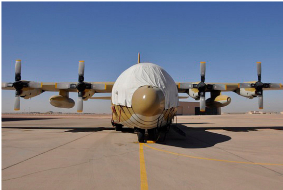
C-130 Cockpit Cover (Windshield/Flight Deck)

This cover type is made from Silver Acrylic Sunbrella canvas and is 100% lined with a soft and smooth microfiber. Bruce's Custom Covers developed this material combination especially for aircraft protection. The outer material is medium weight and treated for water resistance, UV resistance and anti-static buildup. The inner lining is a very soft and smooth microfiber to prevent scratching. The material is very reflective, and tests show that the cabin interior temperature can be reduced to near-ambient temperature on the hottest of days. It is water, ice and snow repellent, yet breathable to allow moisture to escape from between the cover and the aircraft surface.