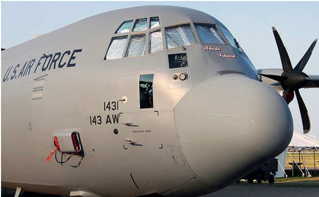
C-130 Cockpit HeatShields

Windshield and Skylight Heatshields are interior sunshades for an aircraft's front windshield and overhead window. The product is a unique composite of closed-cell foam with a silver mylar finish. The semi-rigid design is stiff enough to stand along the inside of the windshield using sun visors or window framing. It folds up flat and easily stores in the included storage sleeve. Some designs may require velcro and suction cups or split right and left sides. A Heatshield is an excellent short-term remedy for cockpit overheating. An external fabric cover is far more effective and practical for long-term protection.