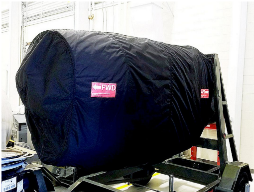
C-130 QEC / Maintenance Cover Set