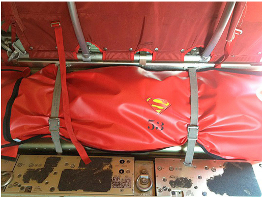
C-130 Seat Bag