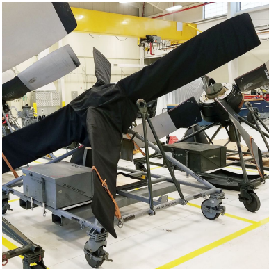
C-130 QEC / Maintenance Cover Set

This cover type is made from Silver Acrylic Sunbrella canvas and is 100% lined with a soft and smooth microfiber. Bruce's Custom Covers developed this material combination especially for aircraft protection. The outer material is medium weight and treated for water resistance, UV resistance and anti-static buildup. The inner lining is a very soft and smooth microfiber to prevent scratching. The material is very reflective, and tests show that the cabin interior temperature can be reduced to near-ambient temperature on the hottest of days. It is water, ice and snow repellent, yet breathable to allow moisture to escape from between the cover and the aircraft surface.