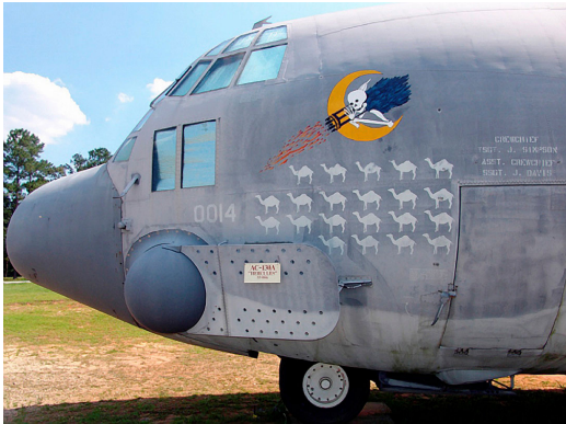
Lockheed AC-130A Flight Deck HeatShield Set