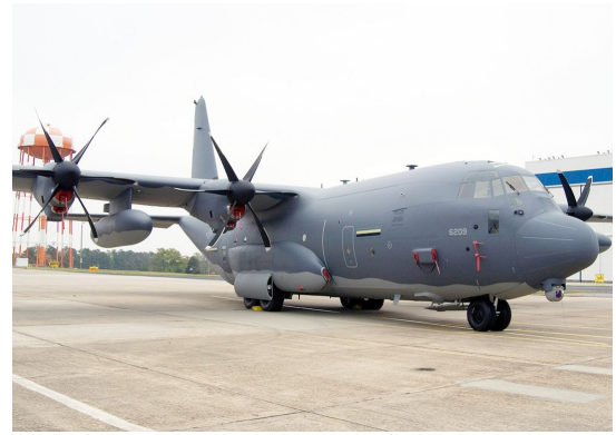
Various plugs and covers for MC-130J(Pitot Covers, Air Conditioning Plugs, Engine Plugs)