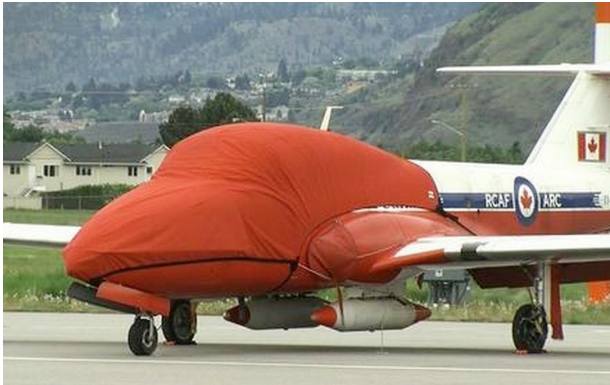
Canadair CT-114 Canopy/Nose Cover