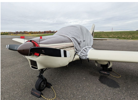
Bellanca 17-30 Extended Travel Canopy Cover with 12" Wing Extensions