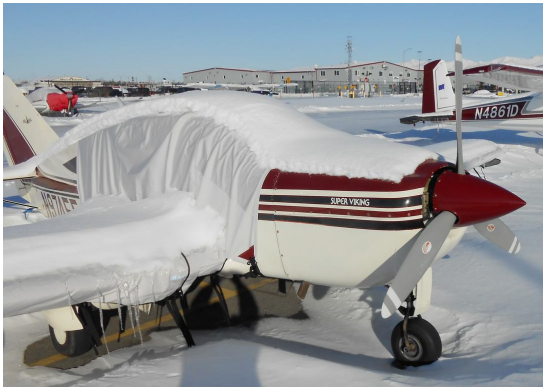
Bellanca Viking Extended Canopy Cover with 36" Wing Extensions, Wing Covers

WINTER USE MATERIAL - Made with Solution-Dyed Polyester fabric, this option is intended for seasonal use to aid in deicing, rain mitigation, or for occasional travel. The material is lighter and more compact, but more susceptible to UV damage and may have a shorter useful life if used continuously outside than the all-year use material.