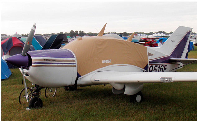
Bellanca Viking Canopy Cover

Travel Covers are made with Silver Solution-Dyed Polyester fabric and only lined over the windshield to save weight. The material is lightweight and more compact for easy stowage in the aircraft. The polyester material is water resistant, but only intended for occasional use outside. We also have an ultra lightweight material available for fitted hangar dust covers. For daily outdoor use, the non-travel Sunbrella Cover is the best choice.