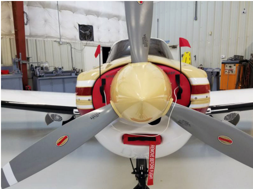
Bellanca Super Viking 17-31A Inlet & Carb Plugs

Engine Inlet Plugs are custom fit for your Bellanca Viking intakes, made with heavy-duty vinyl material, and stuffed with a single block of sculpted urethane foam. Each plug has a zipper that allows the foam to be removed and dried if necessary. Engine plugs have warning flags that are visible from the cockpit or 'remove before flight' streamers sewn onto the face of the plugs. Most plugs are imprinted with the aircraft registration number in black for an extra charge. Storage bag NOT included. Engine plugs may be inserted after flight when the engine is still warm. Engine Inlet Plugs are commonly referred to as Cowl Plugs, Intake Plugs, Cowl Blocks, Engine Blocks, and Engine Bungs.