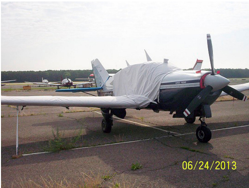
Bellanca Viking Canopy Cover with Wing Root Covers, Wing Covers, Engine Plugs