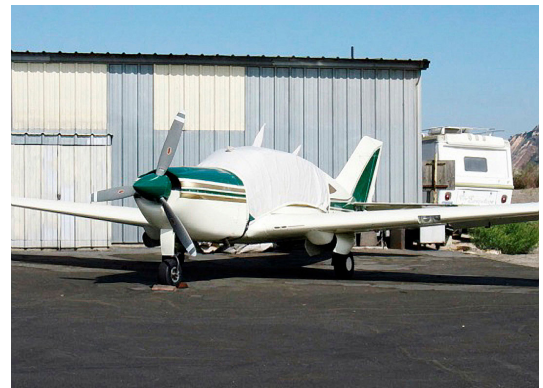
Bellanca Viking Canopy Cover