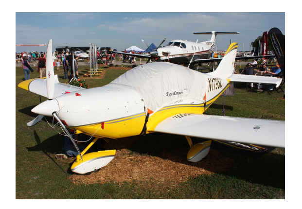
PiperSport Canopy Cover, Engine Plugs