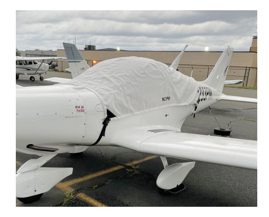
Bristell LSA Canopy Cover

This cover type is made from Silver Acrylic Sunbrella canvas and is 100% lined with a soft and smooth microfiber. Bruce's Custom Covers developed this material combination especially for aircraft protection. The outer material is medium weight and treated for water resistance, UV resistance and anti-static buildup. The inner lining is a very soft and smooth microfiber to prevent scratching. The material is very reflective, and tests show that the cabin interior temperature can be reduced to near-ambient temperature on the hottest of days. It is water, ice and snow repellent, yet breathable to allow moisture to escape from between the cover and the aircraft surface.