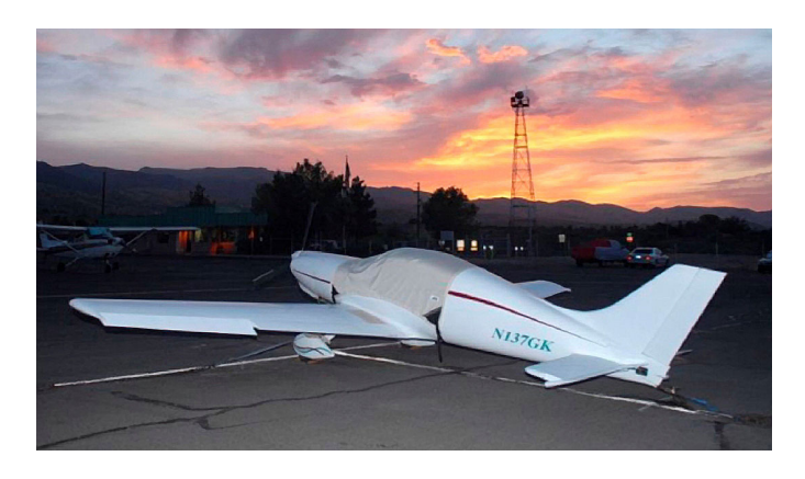
Pulsar Canopy Cover