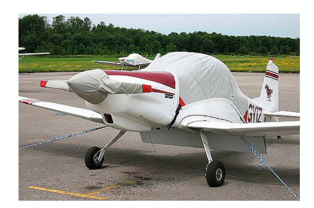
Bushby Mustang Canopy cover and Propellor/Spinner cover

Travel Covers are made with Silver Solution-Dyed Polyester fabric and only lined over the windshield to save weight. The material is lightweight and more compact for easy stowage in the aircraft. The polyester material is water resistant, but only intended for occasional use outside. We also have an ultra lightweight material available for fitted hangar dust covers. For daily outdoor use, the non-travel Sunbrella Cover is the best choice.