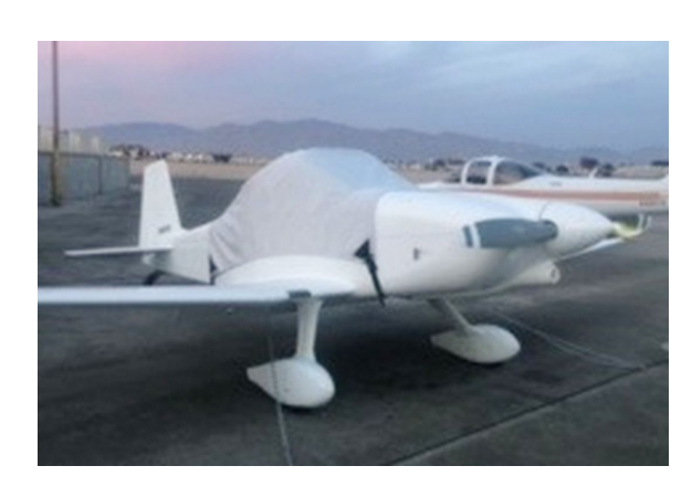
Bushby Mustang Complete Fuselage Cover with Detachable Wing Covers