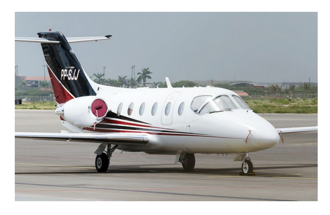
Beechjet Engine Plugs and Cockpit Heatshields