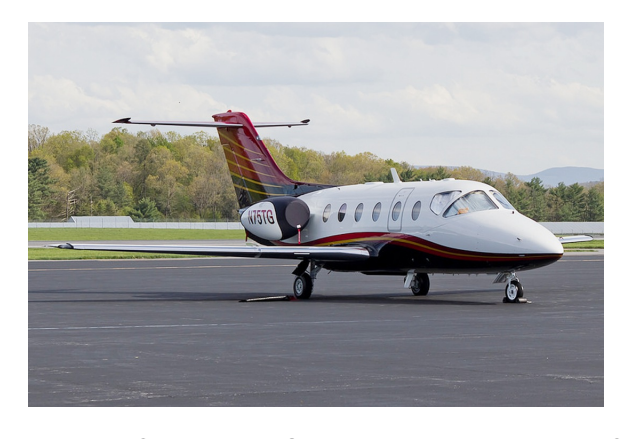
Nextant 400XTi Cockpit HeatShields, Bikini Type Engine Covers