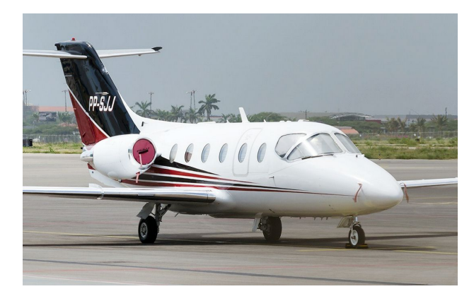
Beechjet Engine Plugs and Cockpit Heatshields

Cockpit Heatshields are interior sunshades for the aircraft's cockpit. The product is a unique composite of closed-cell foam with a silver mylar finish. The semi-rigid design is stiff enough to stand inside the window framing. The set folds up flat and is easily stored in the included storage sleeve. Some designs may require velcro and suction cups. Our Heatshields for jets are offered white side out because some aircraft manufacturers have issued advisories against reflective window inserts due to potential heat damage. A Heatshield is an excellent short-term remedy for cockpit overheating, but an external fabric cover is more effective for long-term protection.