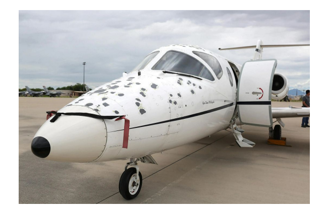
Jayhawk Hail Damage

This cover type is made from Silver Acrylic Sunbrella canvas and is 100% lined with a soft and smooth microfiber. Bruce's Custom Covers developed this material combination especially for aircraft protection. The outer material is medium weight and treated for water resistance, UV resistance and anti-static buildup. The inner lining is a very soft and smooth microfiber to prevent scratching. The material is very reflective, and tests show that the cabin interior temperature can be reduced to near-ambient temperature on the hottest of days. It is water, ice and snow repellent, yet breathable to allow moisture to escape from between the cover and the aircraft surface.