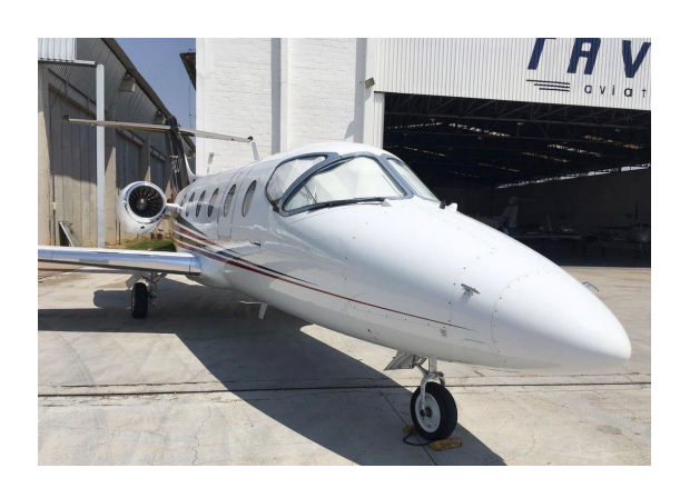
Beechjet Cockpit Heatshields