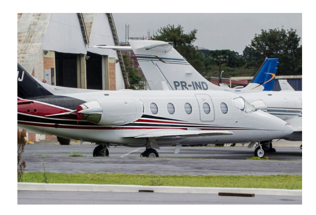
Beechjet Engine Plugs and Cockpit Heatshields

The Engine Inlet Plugs are custom fit for your Hawker Beechcraft Beechjet 400, Hawker 400XP (T1A, T400 Jayhawk) intakes, made with heavy-duty vinyl material, and stuffed with a single block of sculpted urethane foam. Each plug has a zipper that allows the foam to be removed and dried if necessary. Engine plugs have 'remove before flight' streamers sewn onto the face of the plugs. Most plugs are imprinted with the aircraft registration number in black for an extra charge. Storage bag NOT included. Engine plugs may be inserted after flight when the engine is still warm. Engine Inlet Plugs are commonly referred to as Cowl Plugs, Intake Plugs, Cowl Blocks, Engine Blocks, and Engine Bungs.