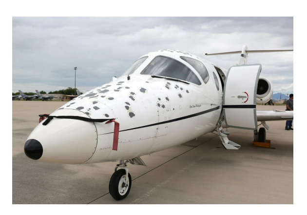
Jayhawk Hail Damage