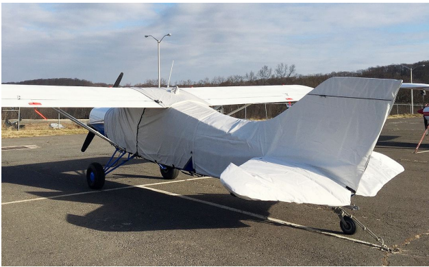
Maule M-5-235C Extended Canopy Cover, Empennage Cover