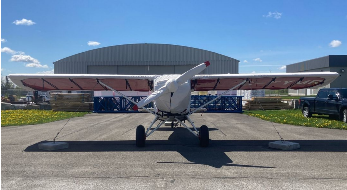
Bearhawk 4-Place Complete Cover Set