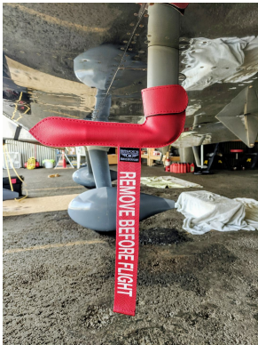
Van's RV-14 Pitot Cover