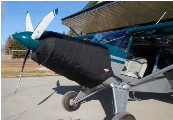
Bearhawk Insulated Engine Cover