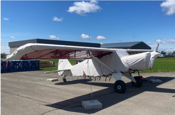
Bearhawk 4-Place Complete Cover Set, AFTER

WINTER USE MATERIAL - Made with Solution-Dyed Polyester fabric, this option is intended for seasonal use to aid in deicing, rain mitigation, or for occasional travel. The material is lighter and more compact, but more susceptible to UV damage and may have a shorter useful life if used continuously outside than the all-year use material.