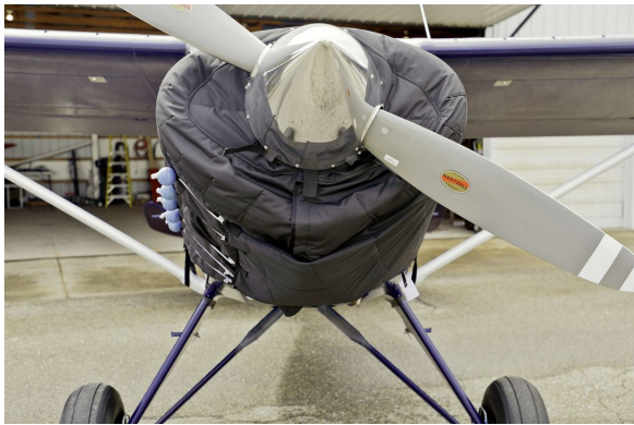
Bearhawk Insulated Engine Cover

This cover type is made from Silver Acrylic Sunbrella canvas and is 100% lined with a soft and smooth microfiber. Bruce's Custom Covers developed this material combination especially for aircraft protection. The outer material is medium weight and treated for water resistance, UV resistance and anti-static buildup. The inner lining is a very soft and smooth microfiber to prevent scratching. The material is very reflective, and tests show that the cabin interior temperature can be reduced to near-ambient temperature on the hottest of days. It is water, ice and snow repellent, yet breathable to allow moisture to escape from between the cover and the aircraft surface.