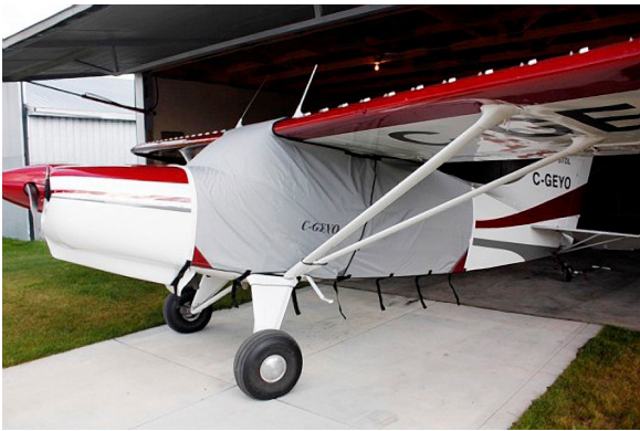
Maule Over-Top Extended Canopy Cover

This cover type is made from Silver Acrylic Sunbrella canvas and is 100% lined with a soft and smooth microfiber. Bruce's Custom Covers developed this material combination especially for aircraft protection. The outer material is medium weight and treated for water resistance, UV resistance and anti-static buildup. The inner lining is a very soft and smooth microfiber to prevent scratching. The material is very reflective, and tests show that the cabin interior temperature can be reduced to near-ambient temperature on the hottest of days. It is water, ice and snow repellent, yet breathable to allow moisture to escape from between the cover and the aircraft surface.