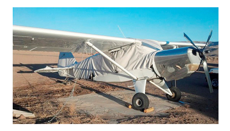
Bearhawk Canopy & Empennage Cover

This cover type is made from Silver Acrylic Sunbrella canvas and is 100% lined with a soft and smooth microfiber. Bruce's Custom Covers developed this material combination especially for aircraft protection. The outer material is medium weight and treated for water resistance, UV resistance and anti-static buildup. The inner lining is a very soft and smooth microfiber to prevent scratching. The material is very reflective, and tests show that the cabin interior temperature can be reduced to near-ambient temperature on the hottest of days. It is water, ice and snow repellent, yet breathable to allow moisture to escape from between the cover and the aircraft surface.