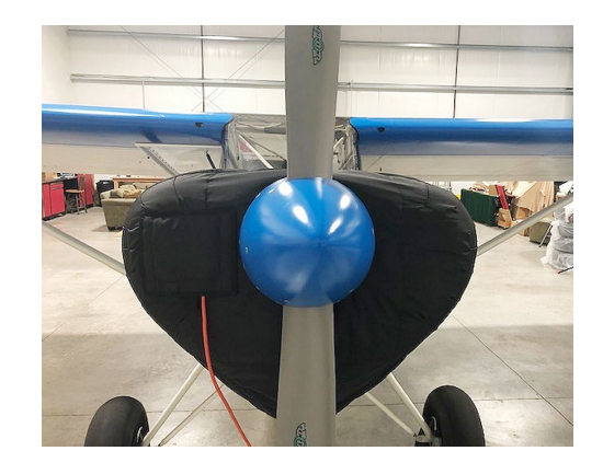
Bearhawk Patrol Insulated Engine Cover, with electric heater access flap