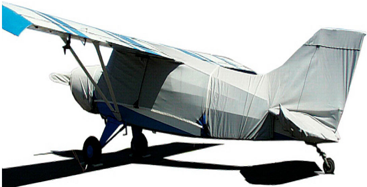
Maule Empennage, Engine & Prop Covers