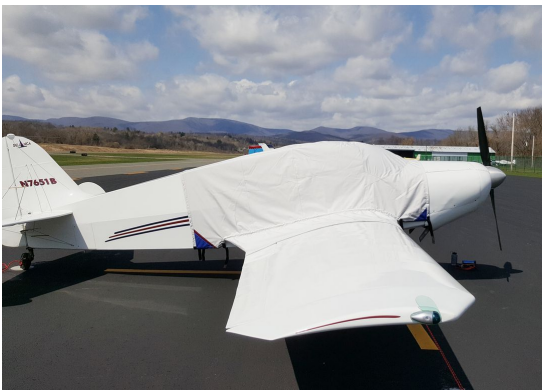
Bellanca Cruisemaster Extended Canopy Cover with 36" Wing Extensions.