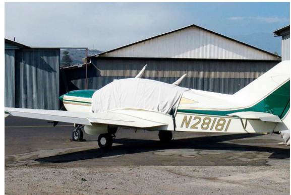
Bellanca Viking Canopy Cover