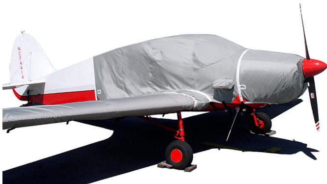
Extended Canopy Cover w/12" Wing Extensions, Engine & Wing Covers