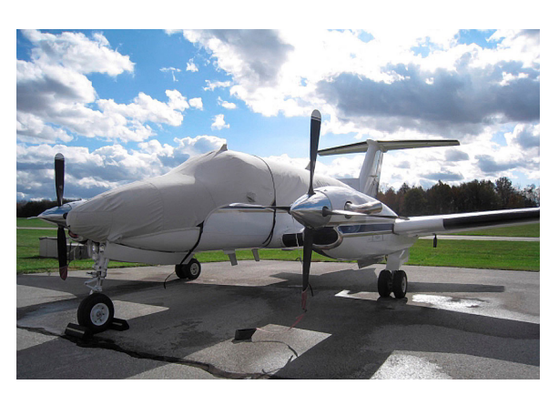
King Air B200 Canopy/Nose Cover