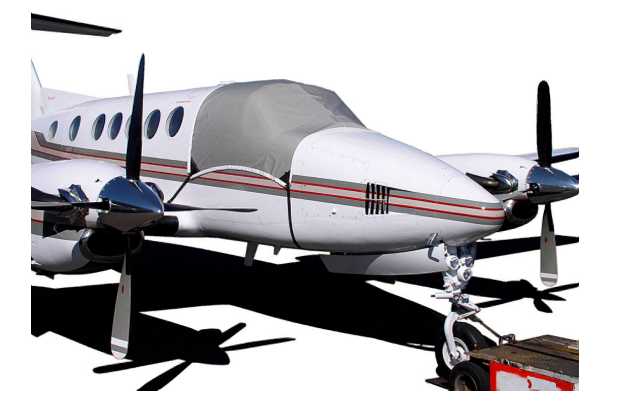
King Air 200/300 Snap-On Windshield Cover

This cover type is made from Silver Acrylic Sunbrella canvas and is 100% lined with a soft and smooth microfiber. Bruce's Custom Covers developed this material combination especially for aircraft protection. The outer material is medium weight and treated for water resistance, UV resistance and anti-static buildup. The inner lining is a very soft and smooth microfiber to prevent scratching. The material is very reflective, and tests show that the cabin interior temperature can be reduced to near-ambient temperature on the hottest of days. It is water, ice and snow repellent, yet breathable to allow moisture to escape from between the cover and the aircraft surface.