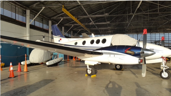
Raytheon Beech King Air Cockpit Cover, Prop Tie/Exhaust Covers, Inlet Plugs