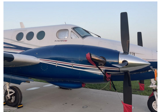
Beech King Air C90 Cockpit HeatShields