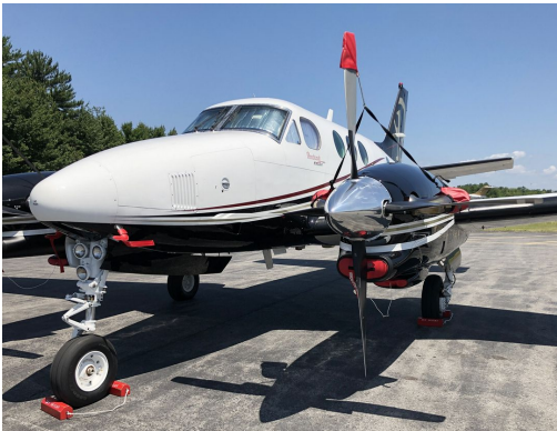
Beech C90A Prop Tie Downs/Exhaust Covers