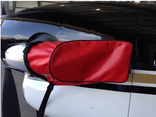
King Air Exhaust Stack Cover

This cover type is made from Silver Acrylic Sunbrella canvas and is 100% lined with a soft and smooth microfiber. Bruce's Custom Covers developed this material combination especially for aircraft protection. The outer material is medium weight and treated for water resistance, UV resistance and anti-static buildup. The inner lining is a very soft and smooth microfiber to prevent scratching. The material is very reflective, and tests show that the cabin interior temperature can be reduced to near-ambient temperature on the hottest of days. It is water, ice and snow repellent, yet breathable to allow moisture to escape from between the cover and the aircraft surface.