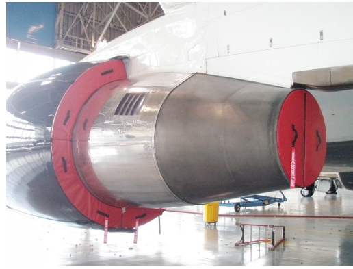
Exhaust Plugs Ship Set, incl. Fan Thrust Reverser and Exhaust Plugs P/N: B767-200