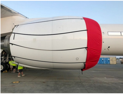
Boeing 777 Intake Covers, GE9X Engine