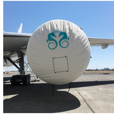
Boeing 777 Intake Covers, GE Engine