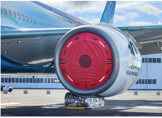
Boeing 777 Intake Plugs, framed, Bi-fold design.