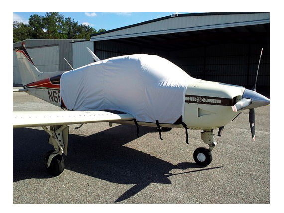
Beech Sport Extended Canopy Cover

Beech Sierra Canopy Cover, Engine Plugs, Tailcone Cover