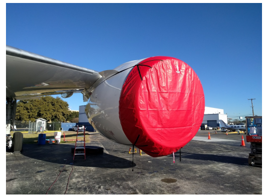
Boeing 787 Intake Cover