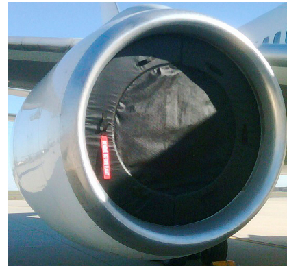
Boeing 757 Intake Plugs, RB.211 Engine (Comes in colors)