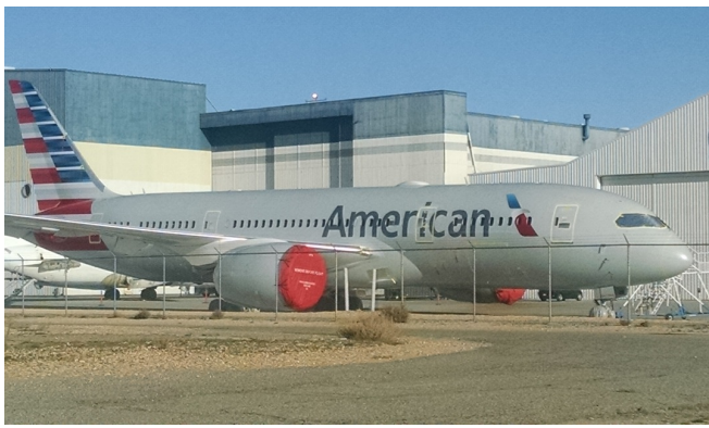
Boeing 787 Intake Covers