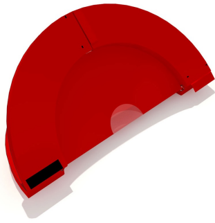
Airbus A330 Intake Plug, framed bi-fold type