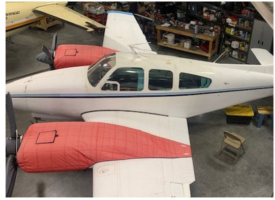
Beech Baron B55 Insulated Engine Covers