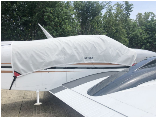
Baron G58 Travel Cover

Travel Covers are made with Silver Solution-Dyed Polyester fabric and only lined over the windshield to save weight. The material is lightweight and more compact for easy stowage in the aircraft. The polyester material is water resistant, but only intended for occasional use outside. We also have an ultra lightweight material available for fitted hangar dust covers. For daily outdoor use, the non-travel Sunbrella Cover is the best choice.