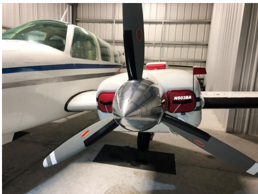
Beech Baron Engine Plugs

Engine Inlet Plugs are custom fit for your Beech Baron 58, G58 intakes, made with heavy-duty vinyl material, and stuffed with a single block of sculpted urethane foam. Each plug has a zipper that allows the foam to be removed and dried if necessary. Engine plugs have warning flags that are visible from the cockpit or 'remove before flight' streamers sewn onto the face of the plugs. Most plugs are imprinted with the aircraft registration number in black for an extra charge. Storage bag NOT included. Engine plugs may be inserted after flight when the engine is still warm. Engine Inlet Plugs are commonly referred to as Cowl Plugs, Intake Plugs, Cowl Blocks, Engine Blocks, and Engine Bungs.