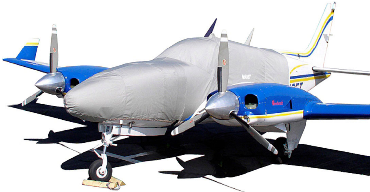
Baron Canopy/Nose Cover