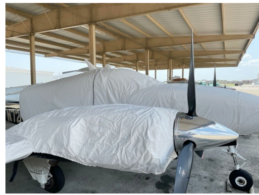
Beech Baron 58P Extended Canopy/Nose Cover, Wing/Engine Covers (test fit)