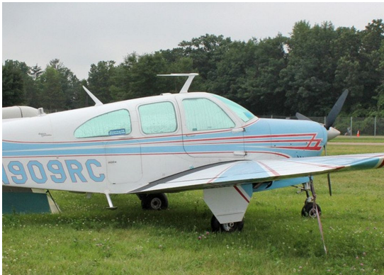
Beech Bonanza/Debonair HeatShield Set

Windshield Heatshields are interior sunshades for an aircraft's front windshield. The product is a unique composite of closed-cell foam with a silver mylar finish. The semi-rigid design is stiff enough to stand along the inside of the windshield using sun visors or window framing. It folds up flat and easily stores in the included storage sleeve. Some designs may require velcro and suction cups or split right and left sides. A Heatshield is an excellent short-term remedy for cockpit overheating. An external fabric cover is far more effective and practical for long-term protection.