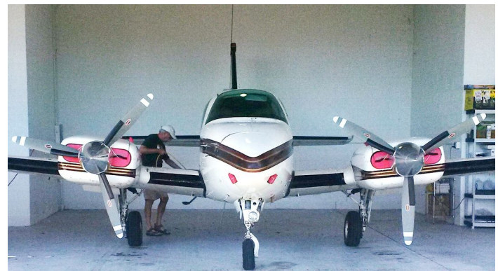
Beech Baron 58 Engine Inlet Plugs, Heater Inlet Plugs