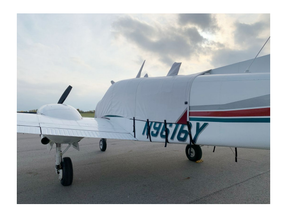
Beech Twin Bonanza Canopy/Nose Cover

This cover type is made from Silver Acrylic Sunbrella canvas and is 100% lined with a soft and smooth microfiber. Bruce's Custom Covers developed this material combination especially for aircraft protection. The outer material is medium weight and treated for water resistance, UV resistance and anti-static buildup. The inner lining is a very soft and smooth microfiber to prevent scratching. The material is very reflective, and tests show that the cabin interior temperature can be reduced to near-ambient temperature on the hottest of days. It is water, ice and snow repellent, yet breathable to allow moisture to escape from between the cover and the aircraft surface.