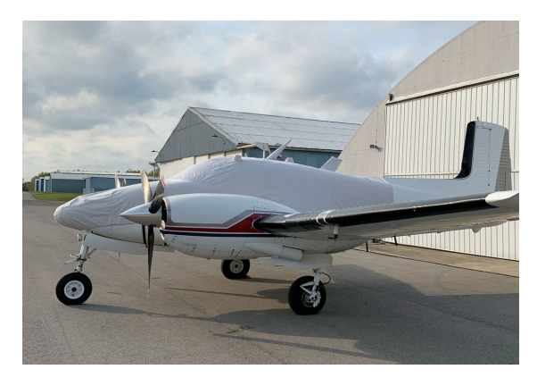
Beech Twin Bonanza Canopy/Nose Cover