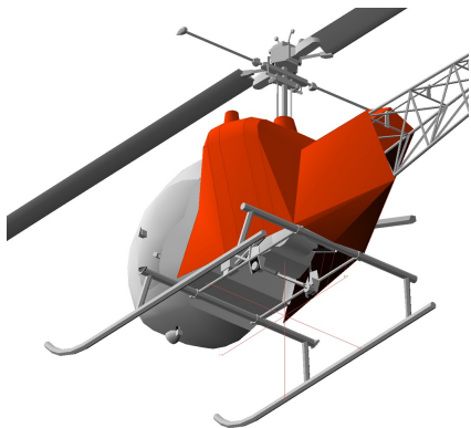
Bell 47 Engine Area Cover, 3D model

WINTER USE MATERIAL - Made with Solution-Dyed Polyester fabric, this option is intended for seasonal use to aid in deicing, rain mitigation, or for occasional travel. The material is lighter and more compact, but more susceptible to UV damage and may have a shorter useful life if used continuously outside than the all-year use material.