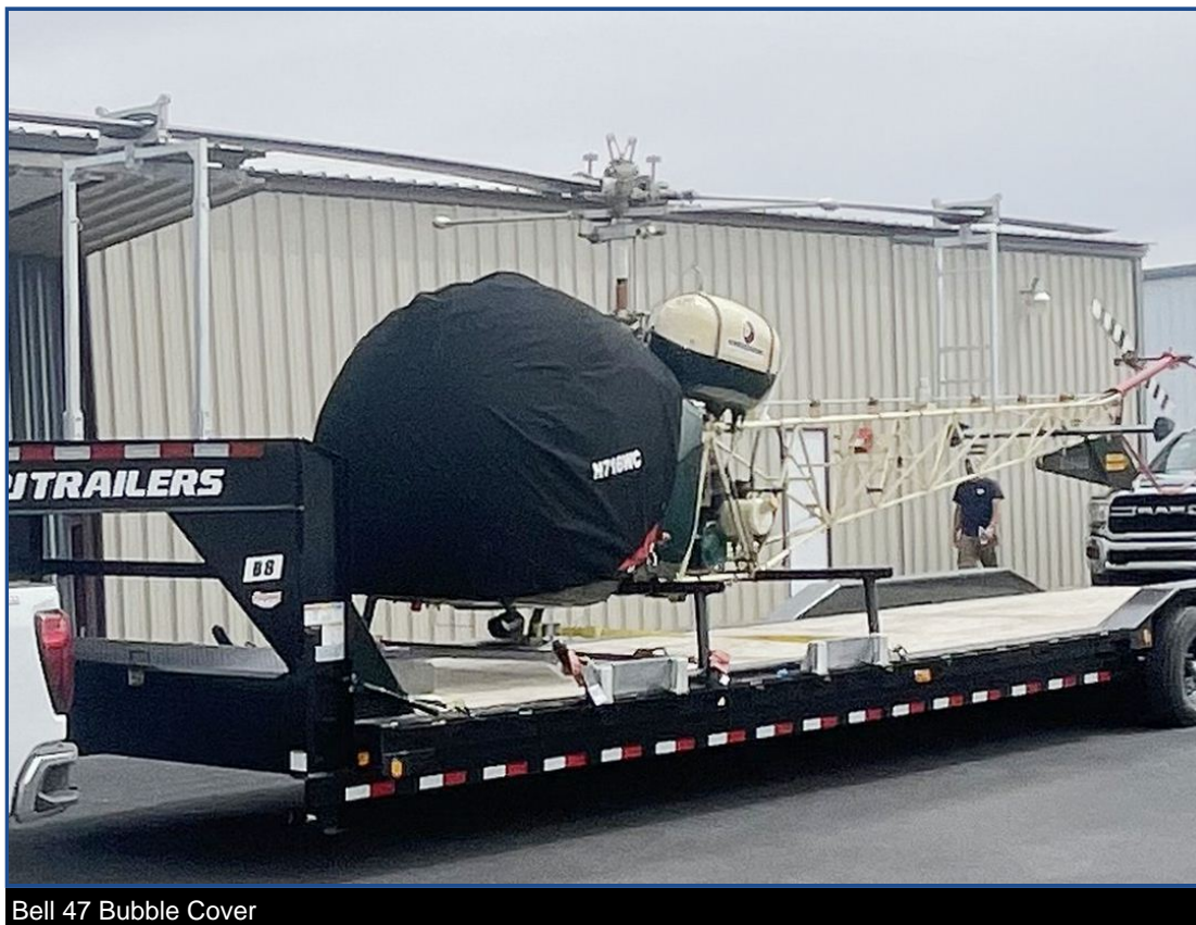
Bell 47 Bubble Cover