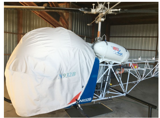
Bell 47 Bubble Cover