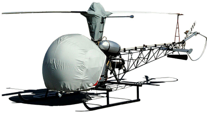
Bubble and Main Rotor Mast Covers