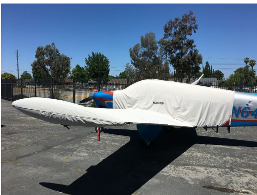
Beech Bonanza A36 Wing Covers with D'Shannon Tip Tanks, Extended Canopy Cover