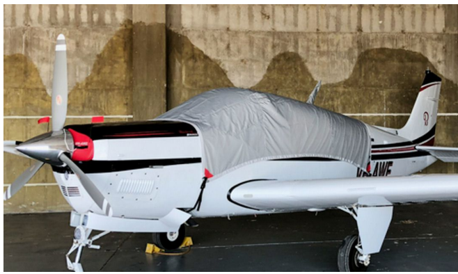
Beech G36 Bonanza Light Weight Travel Canopy Cover, & Engine Plugs