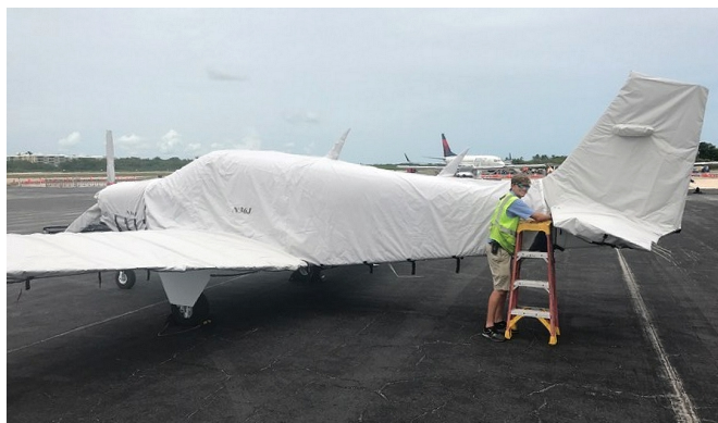
Bonanza G36 Full Cover Set

WINTER USE MATERIAL - Made with Solution-Dyed Polyester fabric, this option is intended for seasonal use to aid in deicing, rain mitigation, or for occasional travel. The material is lighter and more compact, but more susceptible to UV damage and may have a shorter useful life if used continuously outside than the all-year use material.