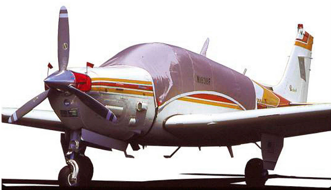
Beech Bonanza A-36 Extended Canopy/Engine Cover, 3-Blade Prop Cover