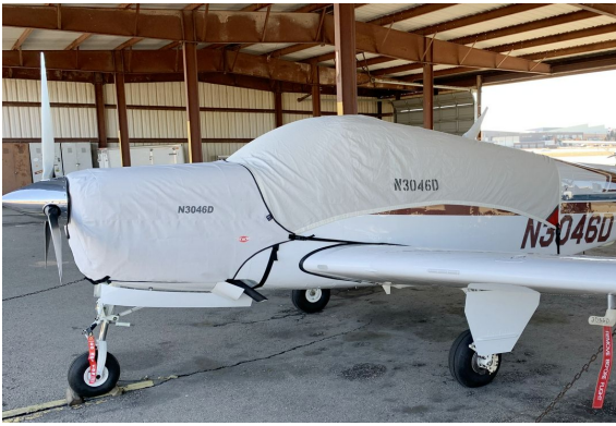
Beech Bonanza Engine Cover, Canopy Cover