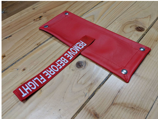
Bonanza 36 Induction Air Filter Cover