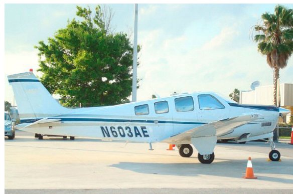
Bonanza A36 HeatShield Set