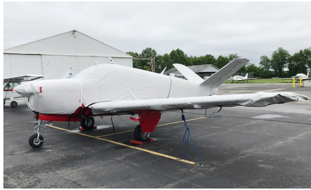
Beech Bonanza/Debonair Extended Canopy Cover (Specify Lg Or Sm Windshield & Lg Or Sm 3rd Window)