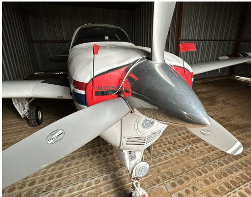
Beech Bonanza A36 Models Engine Inlet Plugs