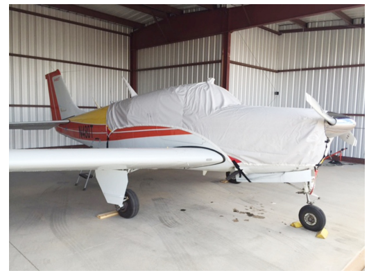
Beech Bonanza Canopy/Engine Cover