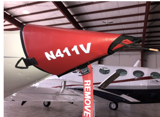
Cessna 335, 340 Wingtip Pads