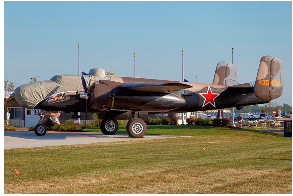
B26 Cockpit/Nose and Gun Turret Covers