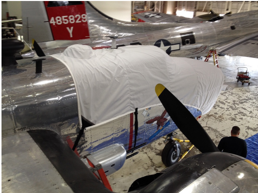
B25 Cockpit/Nose Cover