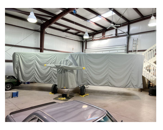
Stearman PT-13 Full Body Dust Cover