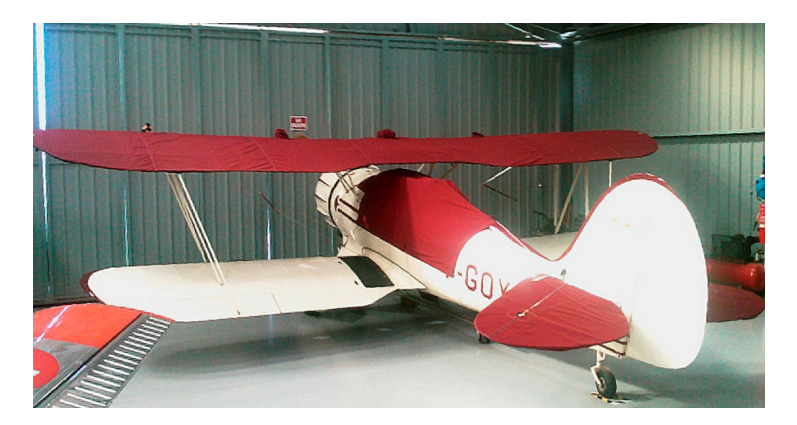
Waco UPF-7 Upper Wing Cover, Horizontal Stabilizer Cover & Canopy Cover

WINTER USE MATERIAL - Made with Solution-Dyed Polyester fabric, this option is intended for seasonal use to aid in deicing, rain mitigation, or for occasional travel. The material is lighter and more compact, but more susceptible to UV damage and may have a shorter useful life if used continuously outside than the all-year use material.