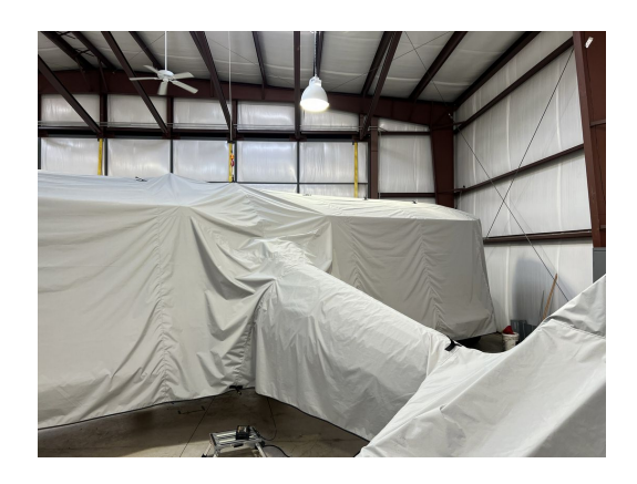
Stearman PT-13 Full Body Dust Cover, Prop Cover Included

Some high value aircraft end up logging lots of hangar time, and become dust magnets in the process. A high quality, well fitting dust cover provides easy assurance that the aircraft's surfaces remain clean and free of grit and grime. Available in a large variety of colors, each dust cover is custom made according to aircraft details and customer preferences. Fire retardant fabrics are also available.