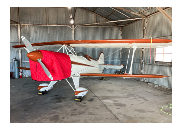
SKYBOLT, Insulated Hangar Blanket, Custom Fit Interior Use)

The material is very reflective, and tests show that the cabin interior temperature can be reduced to near-ambient temperature on the hottest of days. It is water, ice and snow repellent, yet breathable to allow moisture to escape from between the cover and the aircraft surface.