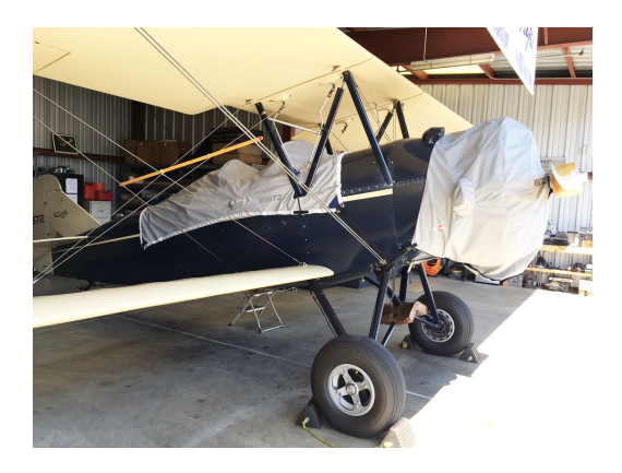
Travel Air 4000 Canopy and Engine Covers, light weight travel Travel Air 4000 Canopy and Engine Covers, light weight travel type