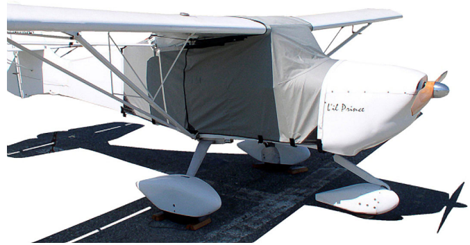
Avid Flyer Extended Canopy Cover