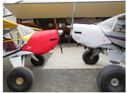
Avid Insulated Engine Covers