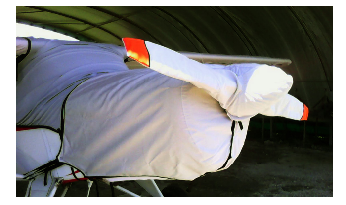
Auster J5 Canopy, Engine, and Propellor Covers