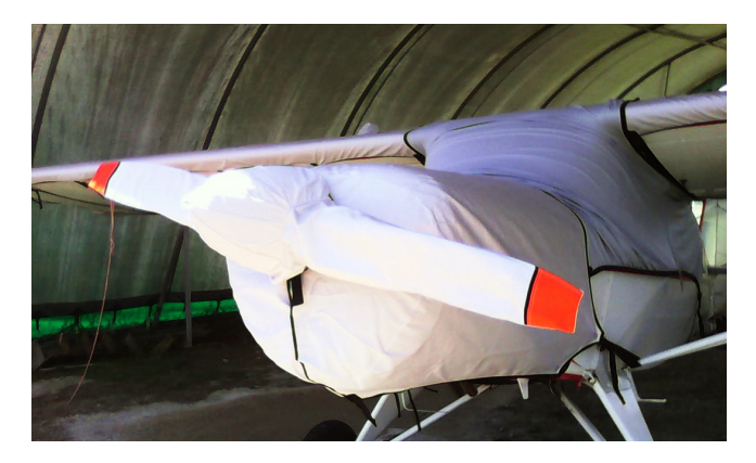
Auster J5 Canopy, Engine, and Propellor Covers