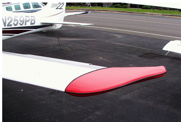
Cirrus SR-22 Wingtip Pad (also available for the Horiz. Stab.

Designed to prevent damage to the aircraft extremities in crowded hangars, these products are made of bright red Naugahyde and thickly padded with a sandwich of closed cell foam.