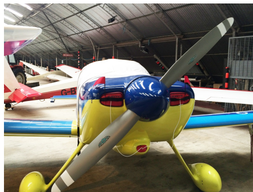
Van's RV-6 Engine Inlet Plugs