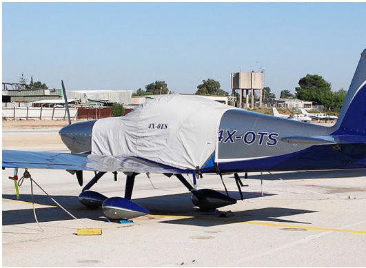
Van's RV-9A Extended Canopy Cover

This cover type is made from Silver Acrylic Sunbrella canvas and is 100% lined with a soft and smooth microfiber. Bruce's Custom Covers developed this material combination especially for aircraft protection. The outer material is medium weight and treated for water resistance, UV resistance and anti-static buildup. The inner lining is a very soft and smooth microfiber to prevent scratching. The material is very reflective, and tests show that the cabin interior temperature can be reduced to near-ambient temperature on the hottest of days. It is water, ice and snow repellent, yet breathable to allow moisture to escape from between the cover and the aircraft surface.