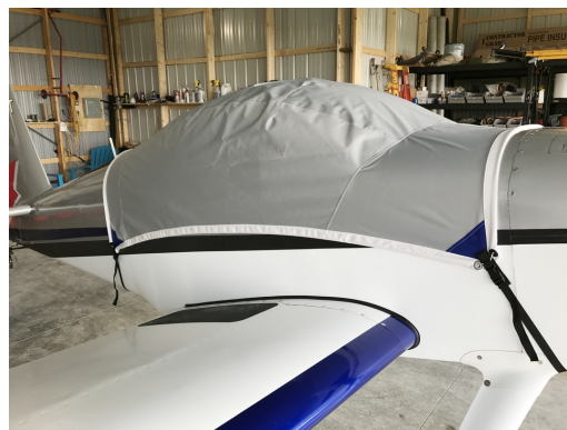
Van's Aircraft RV-9 Travel Cover, Light Weight Travel Canopy Cover