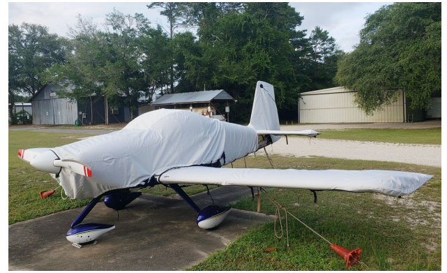
Van's RV-9A Extended Canopy/Engine, Wing & Empennage Covers