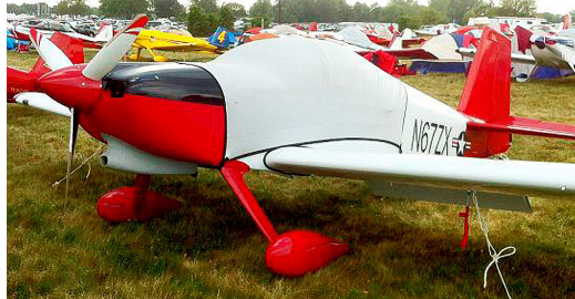
Light Weight Fitted Hangar Dust Cover

Travel Covers are made with Silver Solution-Dyed Polyester fabric and only lined over the windshield to save weight. The material is lightweight and more compact for easy stowage in the aircraft. The polyester material is water resistant, but only intended for occasional use outside. We also have an ultra lightweight material available for fitted hangar dust covers. For daily outdoor use, the non-travel Sunbrella Cover is the best choice.