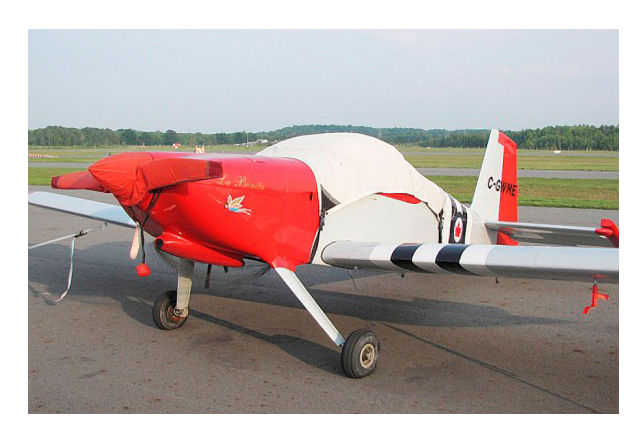
Van's RV-6 2-Blade Prop Cover