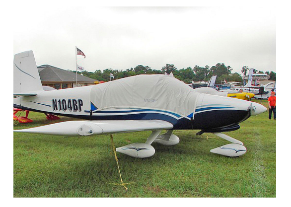
Van's RV-10 Canopy Cover