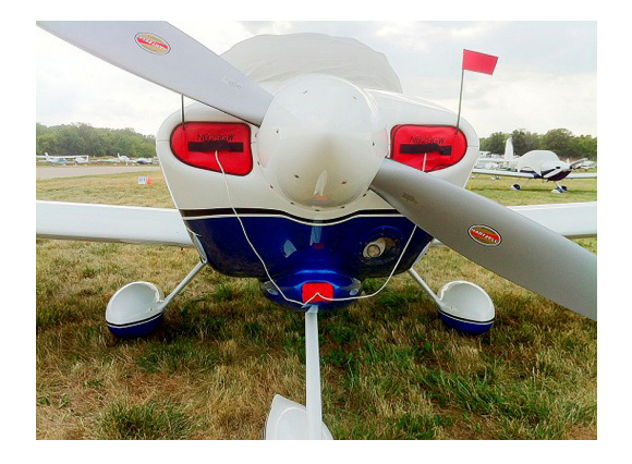
Van's RV-10 Canopy Cover & Engine Inlet Plugs

Engine Inlet Plugs are custom fit for your Direct Fly Alto intakes, made with heavy-duty vinyl material, and stuffed with a single block of sculpted urethane foam. Each plug has a zipper that allows the foam to be removed and dried if necessary. Engine plugs have warning flags that are visible from the cockpit or 'remove before flight' streamers sewn onto the face of the plugs. Most plugs are imprinted with the aircraft registration number in black for an extra charge. Storage bag NOT included. Engine plugs may be inserted after flight when the engine is still warm. Engine Inlet Plugs are commonly referred to as Cowl Plugs, Intake Plugs, Cowl Blocks, Engine Blocks, and Engine Bungs.