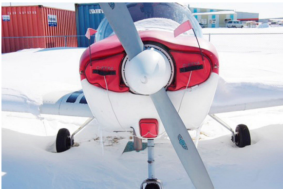
Alarus CH2000 Engine Plugs