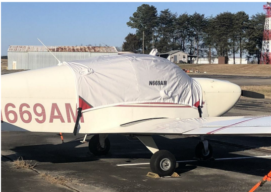
Alarus CH2000 Canopy Cover