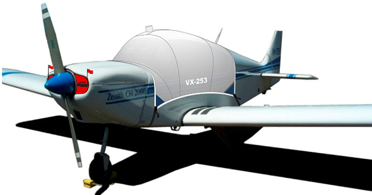
AMD Alarus CH2000 Std Canopy Cover & Engine Plugs (Illustration)

Engine Inlet Plugs are custom fit for your Aircraft Mfg. & Development Alarus CH2000 intakes, made with heavy-duty vinyl material, and stuffed with a single block of sculpted urethane foam. Each plug has a zipper that allows the foam to be removed and dried if necessary. Engine plugs have warning flags that are visible from the cockpit or 'remove before flight' streamers sewn onto the face of the plugs. Most plugs are imprinted with the aircraft registration number in black for an extra charge. Storage bag NOT included. Engine plugs may be inserted after flight when the engine is still warm. Engine Inlet Plugs are commonly referred to as Cowl Plugs, Intake Plugs, Cowl Blocks, Engine Blocks, and Engine Bungs.