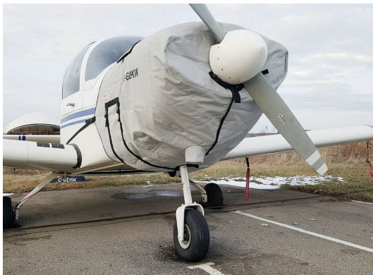
Alarus CH-2000 Insulated Engine Cover

This cover type is made from Silver Acrylic Sunbrella canvas and is 100% lined with a soft and smooth microfiber. Bruce's Custom Covers developed this material combination especially for aircraft protection. The outer material is medium weight and treated for water resistance, UV resistance and anti-static buildup. The inner lining is a very soft and smooth microfiber to prevent scratching. The material is very reflective, and tests show that the cabin interior temperature can be reduced to near-ambient temperature on the hottest of days. It is water, ice and snow repellent, yet breathable to allow moisture to escape from between the cover and the aircraft surface.