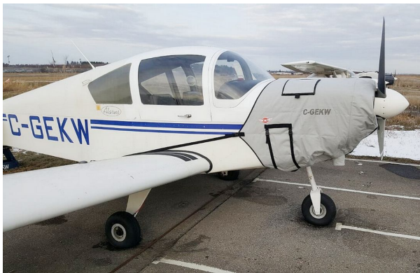
Alarus CH-2000 Insulated Engine Cover