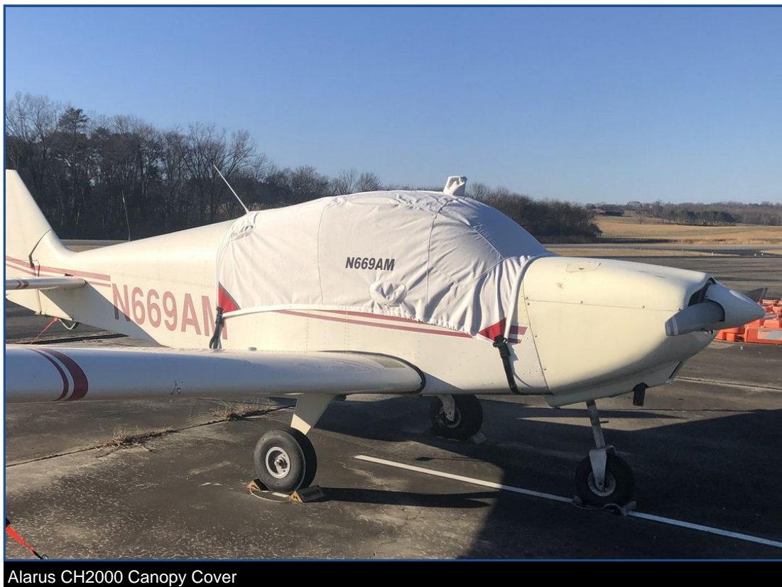
Alarus CH2000 Canopy Cover