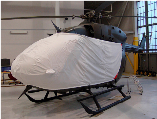
EC-145 Bubble Cover

This cover type is made from Silver Acrylic Sunbrella canvas and is 100% lined with a soft and smooth microfiber. Bruce's Custom Covers developed this material combination especially for aircraft protection. The outer material is medium weight and treated for water resistance, UV resistance and anti-static buildup. The inner lining is a very soft and smooth microfiber to prevent scratching. The material is very reflective, and tests show that the cabin interior temperature can be reduced to near-ambient temperature on the hottest of days. It is water, ice and snow repellent, yet breathable to allow moisture to escape from between the cover and the aircraft surface.