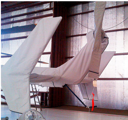
Tail Rotor Cover & Tailboom, Vertical Pylon & Stabilizers Cover

The Tailboom Cover details vary by model, but generally the helicopter tail boom cover encloses the tail boom from the "bottleneck" to the aft end. They usually also cover the horizontal stabilizers, and are custom made to allow for antennae, lights, and other protrusions. They attach with straps underneath the tail boom. Covers for the vertical and horizontal stabilizers are also available separately. Specific information for each model is available on request.