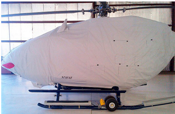
Eurocopter EC-145 Main Body Cover, also covers the bottom belly

Covers developed this material combination especially for aircraft protection. The outer material is medium weight and treated for water resistance, UV resistance and anti-static buildup. The inner lining is a very soft and smooth microfiber to prevent scratching. The material is very reflective, and tests show that the cabin interior temperature can be reduced to near-ambient temperature on the hottest of days. It is water, ice and snow repellent, yet breathable to allow moisture to escape from between the cover and the aircraft surface.