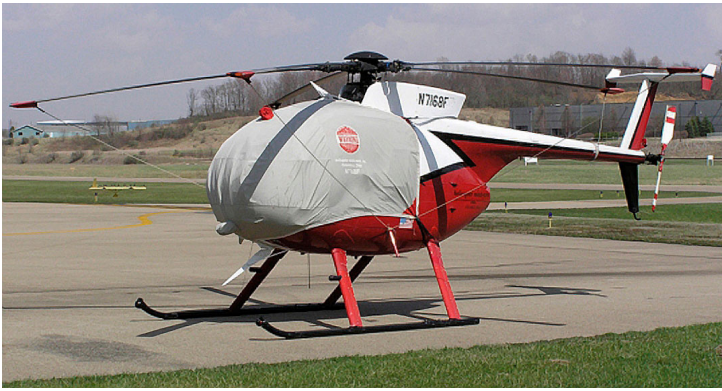
Hughes 500D Bubble Cover with Wire Strike detail and Blade Tie-downs