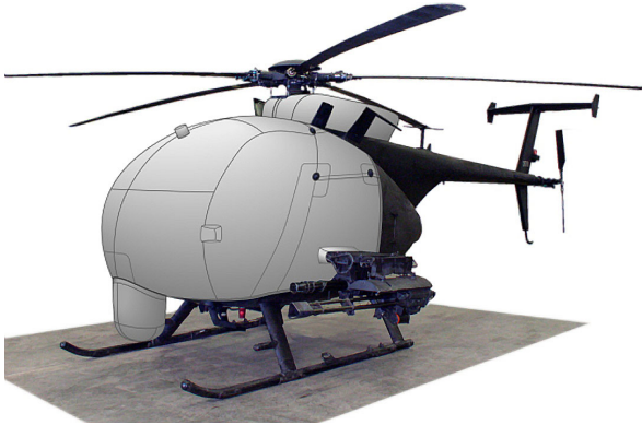
MH-6J Bubble, Flir & Doghouse Covers (illustration)

WINTER USE MATERIAL - Made with Solution-Dyed Polyester fabric, this option is intended for seasonal use to aid in deicing, rain mitigation, or for occasional travel. The material is lighter and more compact, but more susceptible to UV damage and may have a shorter useful life if used continuously outside than the all-year use material.