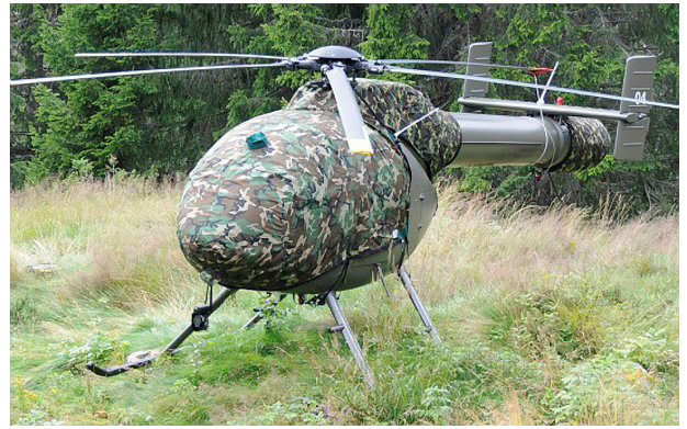
MD520 NOTAR Bubble, Engine, & NOTAR Covers & Blade Tie-downs