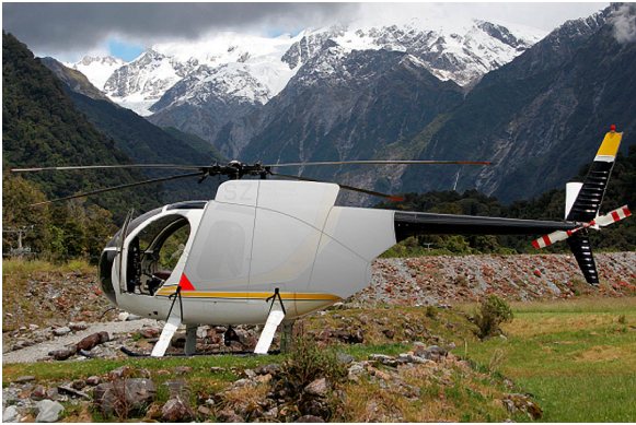
Engine Cover (illustration)