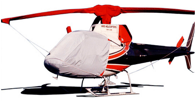
Bubble Cover, Intake/Exhaust, Rotor Mast, Tail Rotor & Main Body Covers