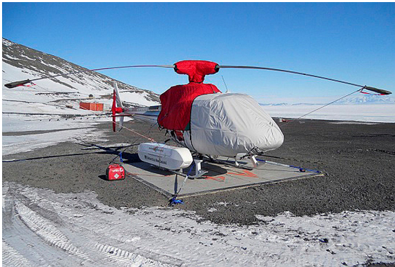
AS350 Bubble Cover w/ Cargo Mirror, Blade Tie-downs, Insulated Engine, Insulated Main Rotor Hub & Insulated Tail Rotor Covers

Travel Covers are made with Silver Solution-Dyed Polyester fabric and fully lined over the entire cover. The material is lightweight and more compact for easy stowage in the aircraft. The polyester material is water resistant, but only intended for occasional use outside. We also have an ultra lightweight material available for fitted hangar dust covers. For daily outdoor use, the non-travel Sunbrella Cover is the best choice.