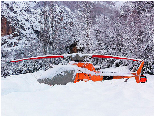
AS350 Bubble Cover, Insulated Main & Tail Rotor Covers, Blade Covers with tid-down detail

WINTER USE MATERIAL - Made with Solution-Dyed Polyester fabric, this option is intended for seasonal use to aid in deicing, rain mitigation, or for occasional travel. The material is lighter and more compact, but more susceptible to UV damage and may have a shorter useful life if used continuously outside than the all-year use material.