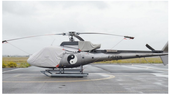
Airbus Helicopter AS350 Bubble Cover & Intake/Exhaust Cover