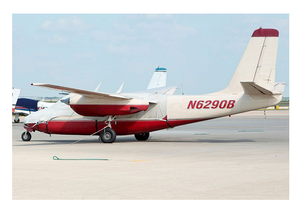
Aero Commander 500 Canopy/Nose Cover, Over-Top Type