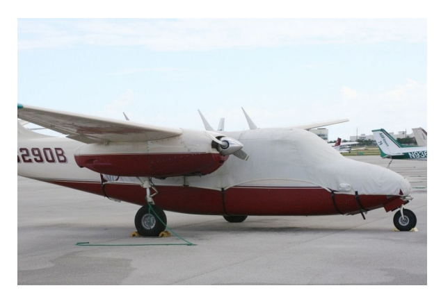
Aero Commander 500 Canopy/Nose Cover Over The Type