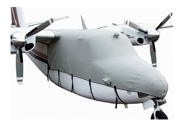
Canopy/Nose Cover (extends over top past leading edge)

Travel Covers are made with Silver Solution-Dyed Polyester fabric and only lined over the windshield to save weight. The material is lightweight and more compact for easy stowage in the aircraft. The polyester material is water resistant, but only intended for occasional use outside. We also have an ultra lightweight material available for fitted hangar dust covers. For daily outdoor use, the non-travel Sunbrella Cover is the best choice.