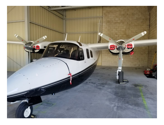
Aero Commander 500-A Pitot Covers

Engine Inlet Plugs are custom fit for your Rockwell Commander 500, 520, 560, Short 680 intakes, made with heavy-duty vinyl material, and stuffed with a single block of sculpted urethane foam. Each plug has a zipper that allows the foam to be removed and dried if necessary. Engine plugs have warning flags that are visible from the cockpit or 'remove before flight' streamers sewn onto the face of the plugs. Most plugs are imprinted with the aircraft registration number in black for an extra charge. Storage bag NOT included. Engine plugs may be inserted after flight when the engine is still warm. Engine Inlet Plugs are commonly referred to as Cowl Plugs, Intake Plugs, Cowl Blocks, Engine Blocks, and Engine Bungs.