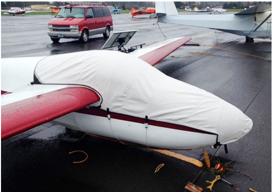
SGS 1-26B Canopy/Nose Cover