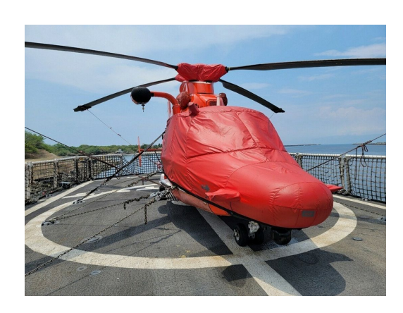
U.S. Coast Guard HH-65 Dolphin Bubble, Engine & Rotor Mast Covers Aerospatiale AS365N2 Bubble, w/Extended Nose/Radome