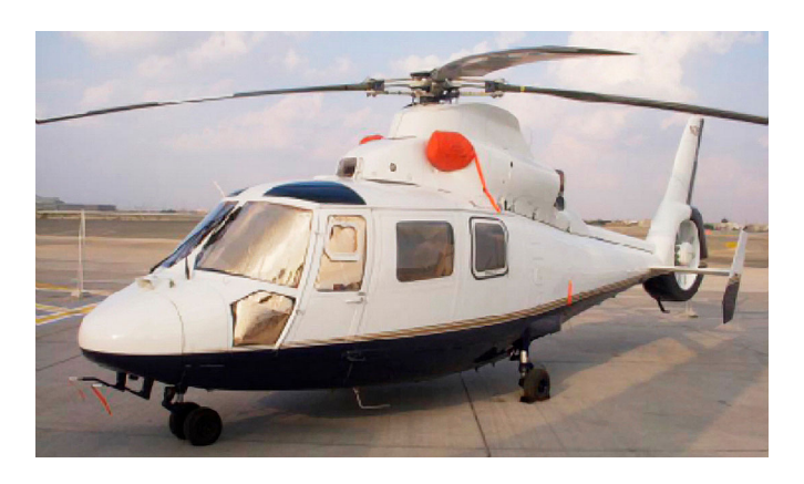
Dauphin HeatShield Set

foam with a silver mylar finish. The semi-rigid design is stiff enough to stand along the inside of the windshield using sun visors or window framing. It folds up flat and easily stores in the included storage sleeve. Some designs may require velcro and suction cups. A Heatshield is an excellent short-term remedy for cockpit overheating.