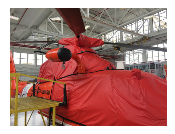
MH-65C Bubble Cover, extended Nose/Radome Model, padded over U.S. Coast Guard HH-65 Dolphin Bubble, Engine & Rotor windows, P/N: A365-210 Mast Covers