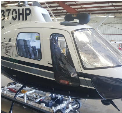
Aerospatiale AS350 Astar, Ecureuil, Esquilo, Fennec Windshield Heatshields