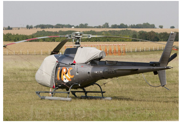
Airbus Helicopter AS350 Bubble Cover & Intake/Exhaust Cover