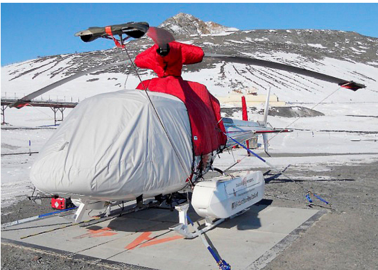
AS350 Bubble Cover w/ Cargo Mirror, Blade Tie-downs, Insulated Engine, Insulated Main Rotor Hub and Insulated Tail Rotor Covers

WINTER USE MATERIAL - Made with Solution-Dyed Polyester fabric, this option is intended for seasonal use to aid in deicing, rain mitigation, or for occasional travel. The material is lighter and more compact, but more susceptible to UV damage and may have a shorter useful life if used continuously outside than the all-year use material.