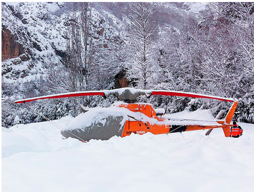
AS350 Bubble Cover, Insulated Main & Tail Rotor Covers, Blade Covers with tid-down detail