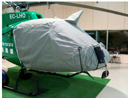
AS350 Bubble Cover with Wire Strike and Cargo Mirror