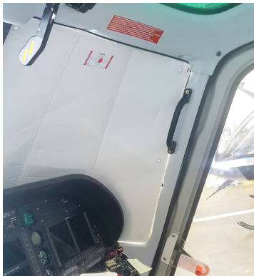
Aerospatiale AS350 Astar, Ecureuil, Esquilo, Fennec Windshield Heatshields

Heatshields are interior sunshades for an aircraft's windows or canopy glass. The product is a unique composite of closed-cell foam with a silver mylar finish. The semi-rigid design is stiff enough to stand along the inside of the windshield using sun visors or window framing. It folds up flat and easily stores in the included storage sleeve. Some designs may require velcro and suction cups. A Heatshield is an excellent short-term remedy for cockpit overheating.