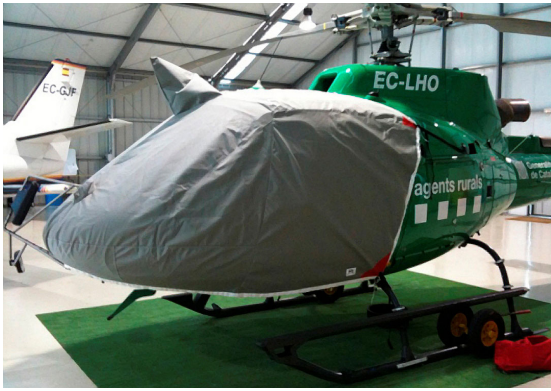
AS350 Bubble Cover with Wire Strike and Cargo Mirror